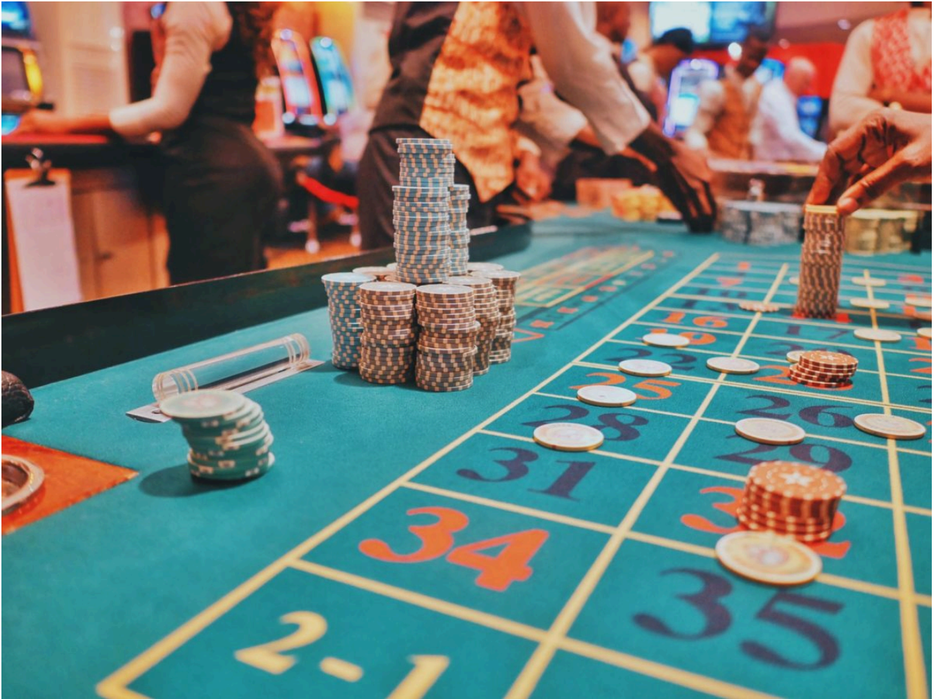
The Beginnings of Online Gambling

One of the key events that marked the beginning of online gambling was the passage of the Free Trade and Processing Act by the island nation of Antigua and Barbuda. In 1994, the small Caribbean country began to grant licences to companies that wanted to provide online gambling services. In the same year, Microgaming was founded and created the first online casino called The Gaming Club. However, The Gaming Club did not become fully operational until 1995.