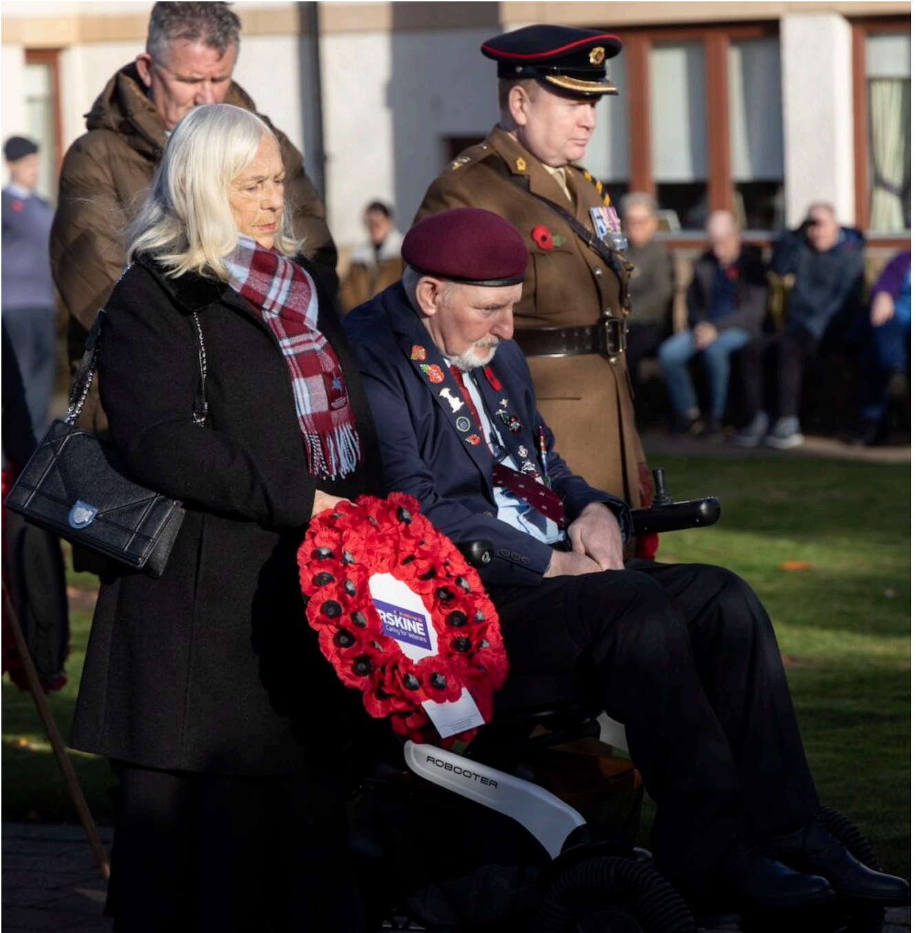
Veterans at the Armistice Day service at Erskine Edinburgh