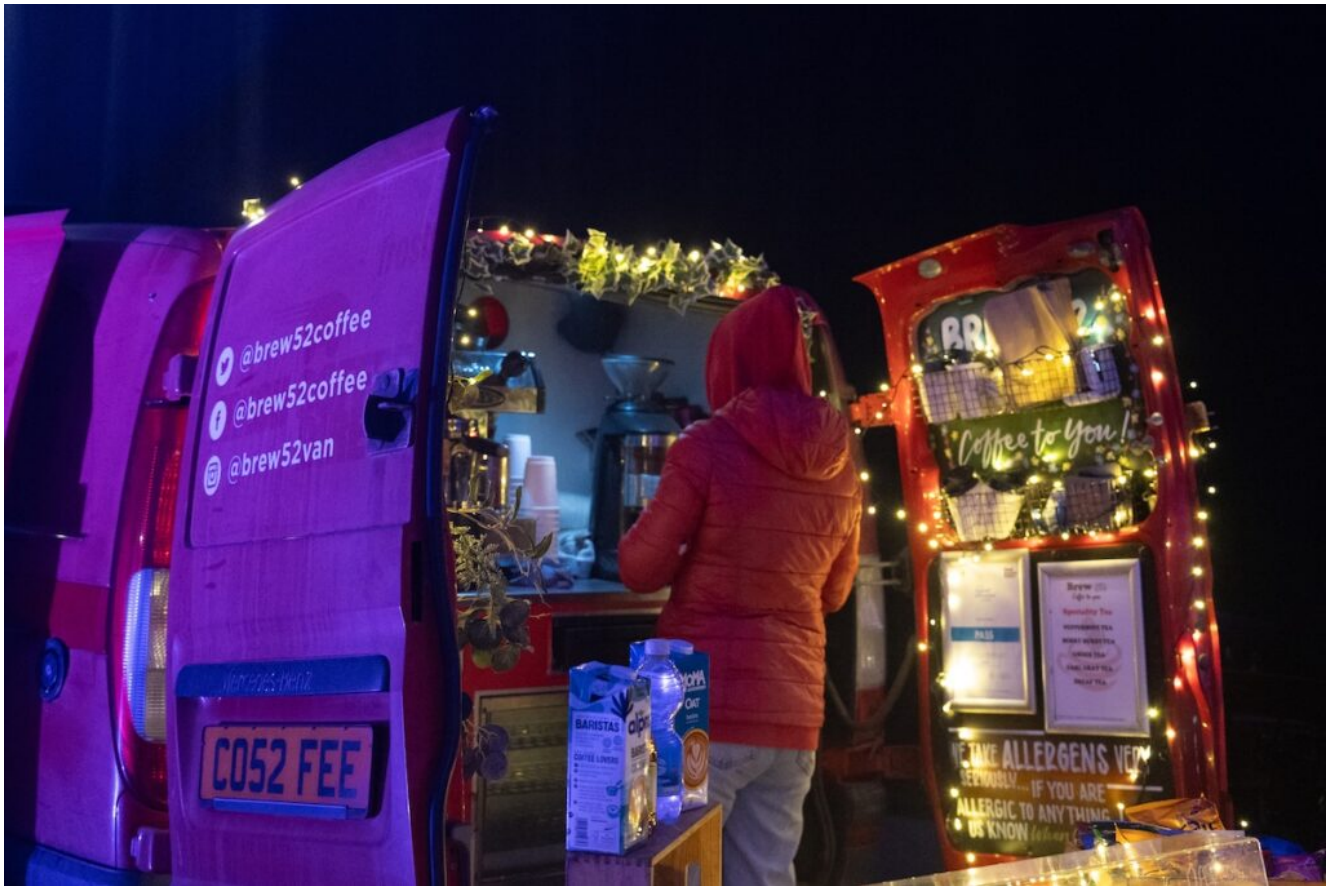
The necessary coffee and hot chocolate provided by Brew 52