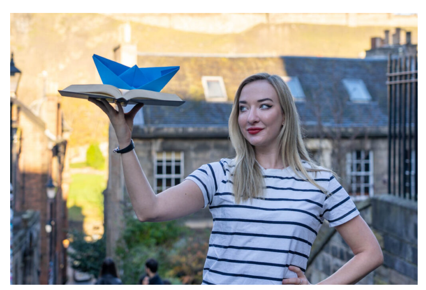
Singer Iona Fyfe urges everyone to Push The Boat Out!