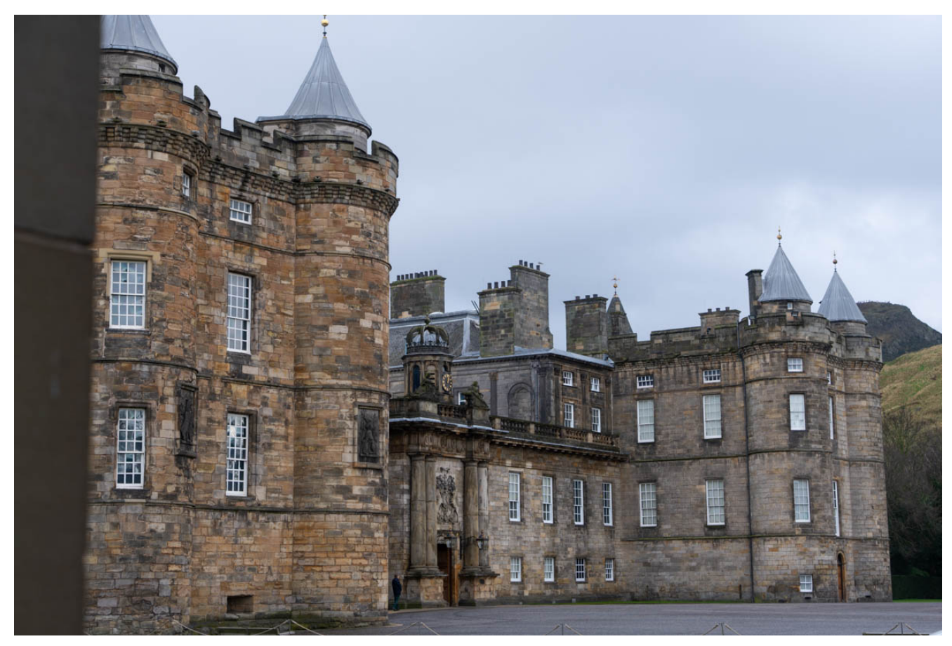
Palace of Holyroodhouse