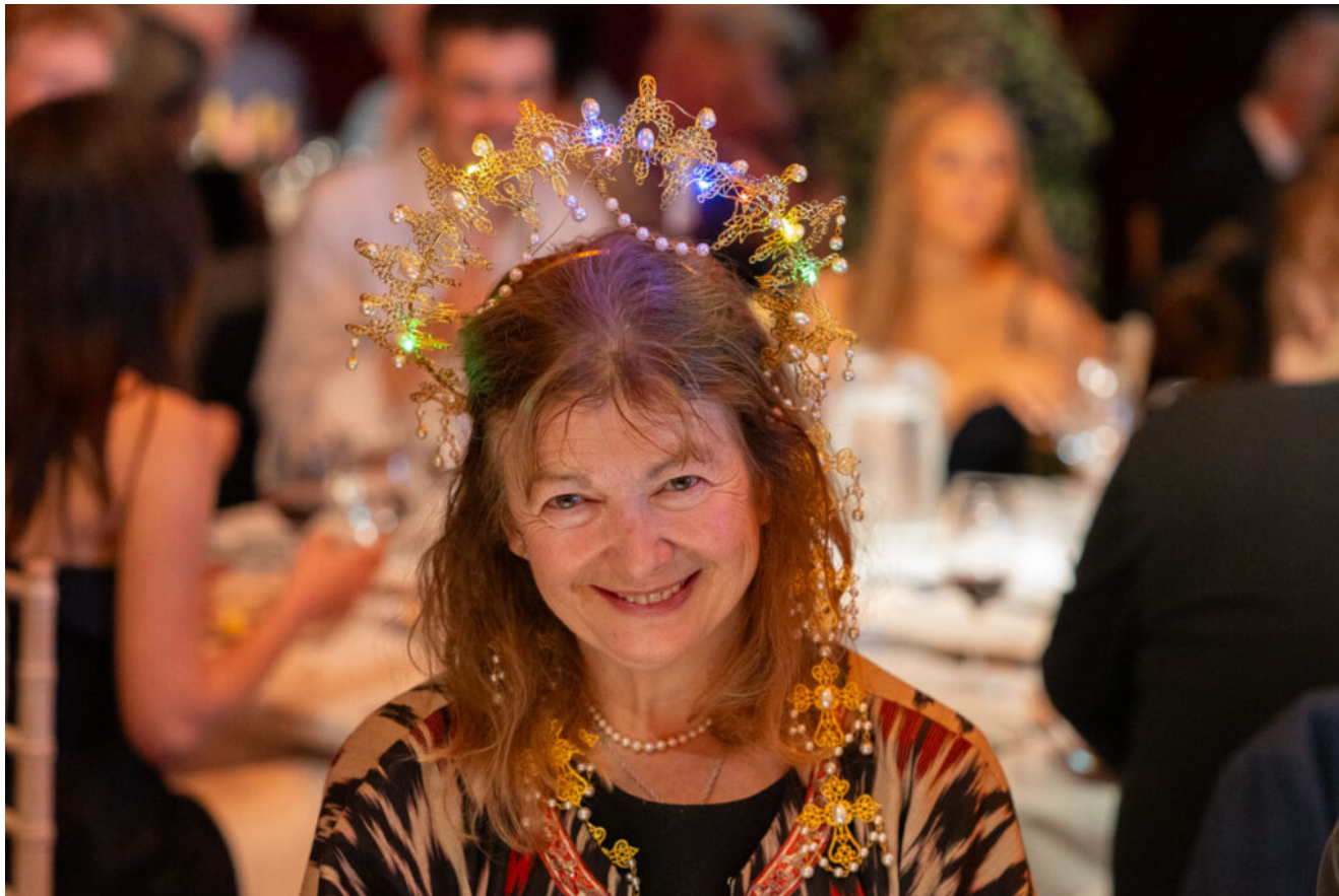
Richard Demarco Fundraiser.