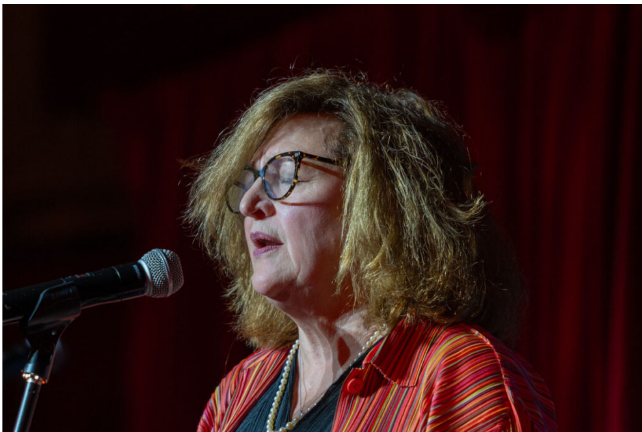
Barbara Dickson sang for the audience