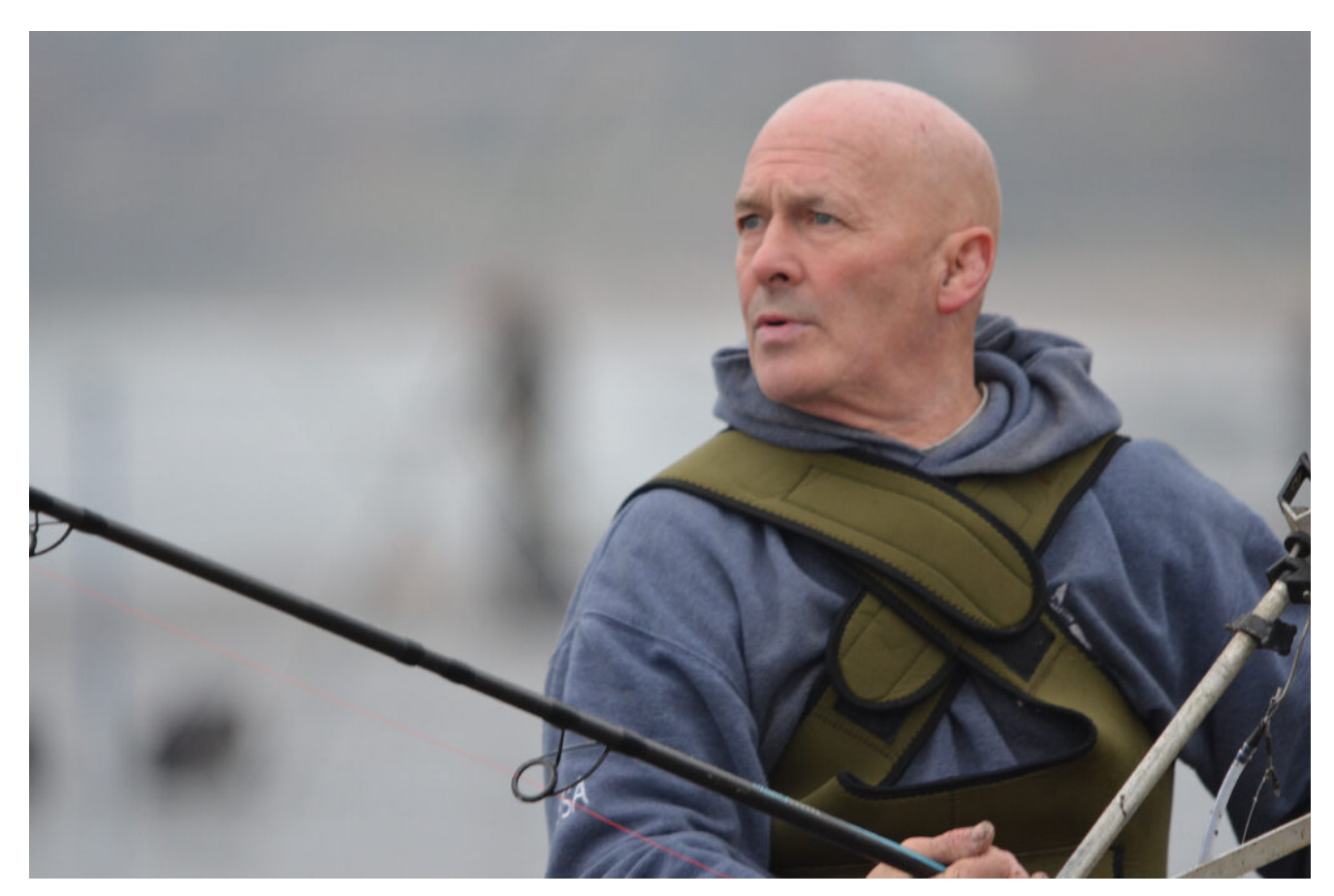
TOTAL CONCENTRATION: One angler focused on his rod tip.