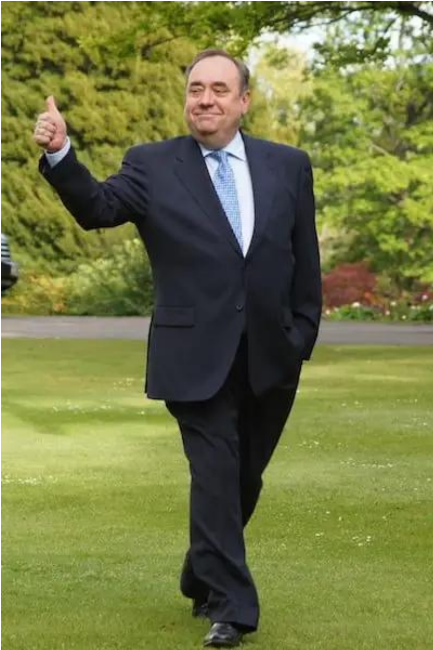
Alex Salmond in 2011 arriving at Prestonfield House after the election victory when SNP secured 69 seats