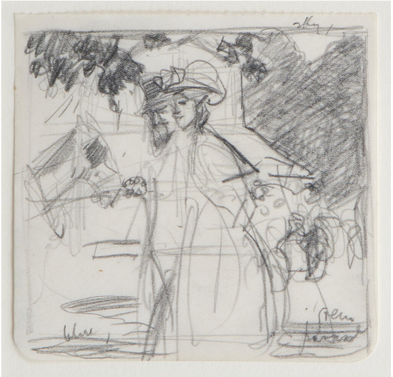
J D Fergusson figures promenading in Paris Photo Saltire News