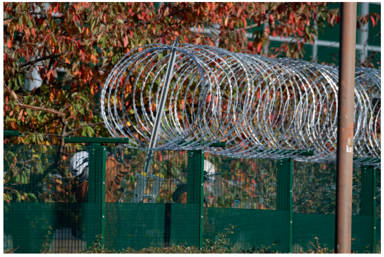
New security measures have been installed at the Leonardo Aerospace facility at Crewe Rd North Edinburgh