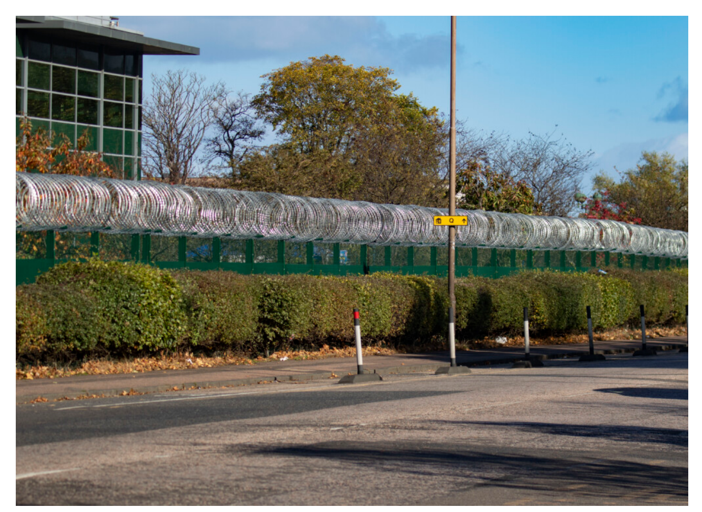
New security measures have been installed at Leonardo Aerospace facility at Crewe Rd North