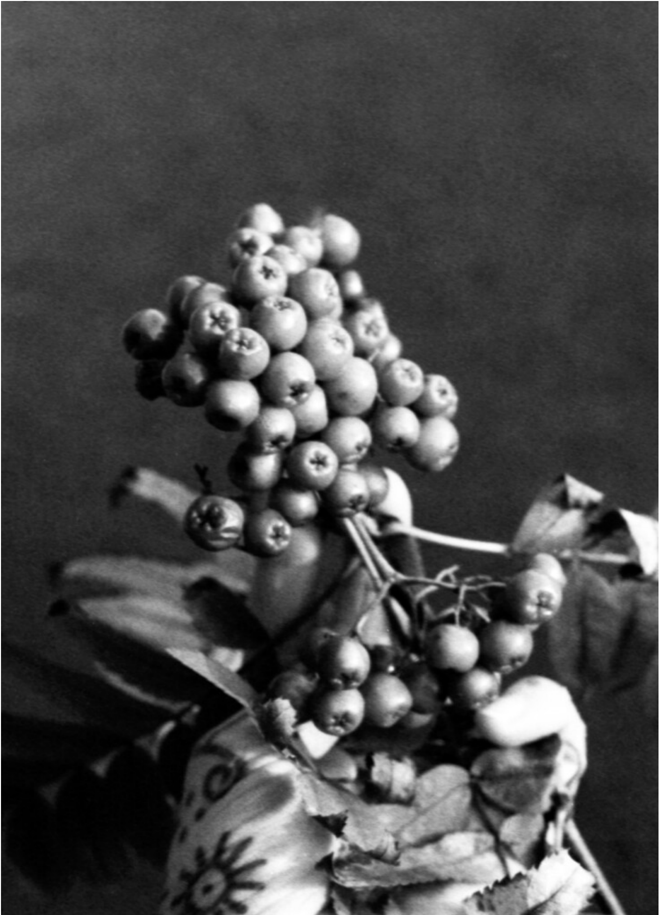
2. Jess Holdengarde, hand processed 35mm negative processed by plant-based developer (made from rowan berry) collected alongside the river clyde, Glasgow. 2023