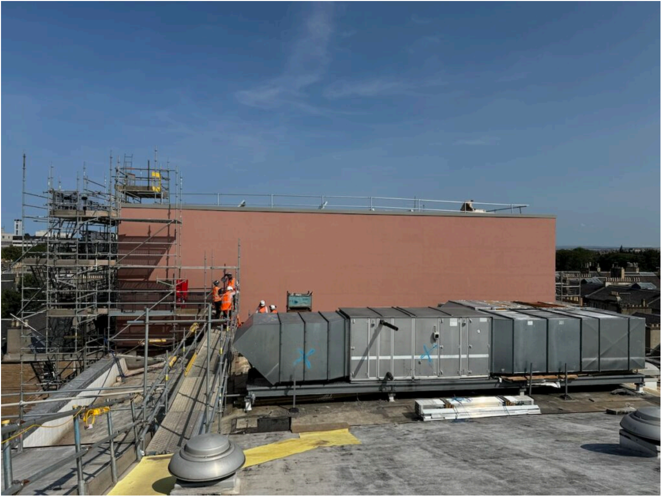
King's Theatre Fly Tower Render_