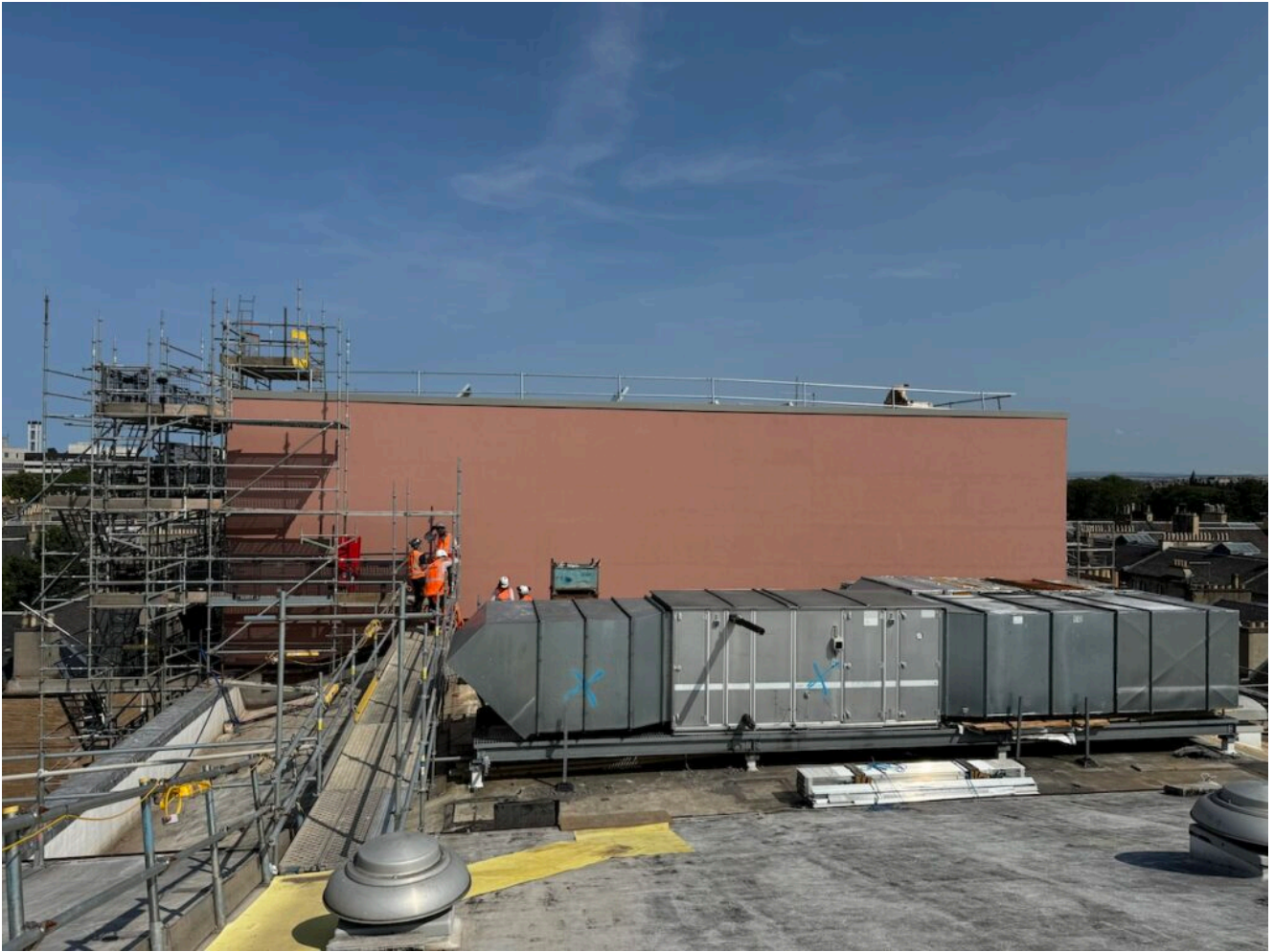
King's Theatre Fly Tower Render_