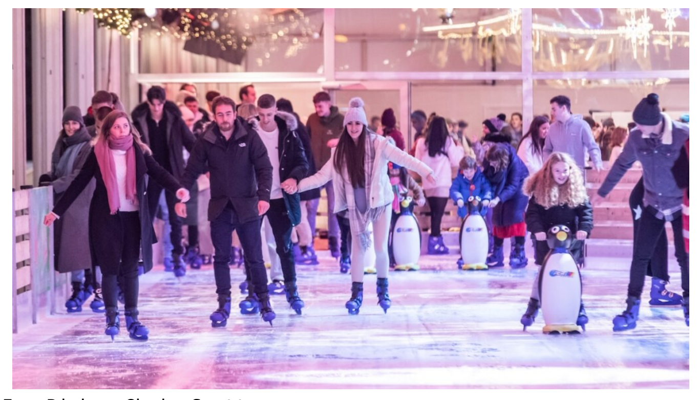
Ice Rink