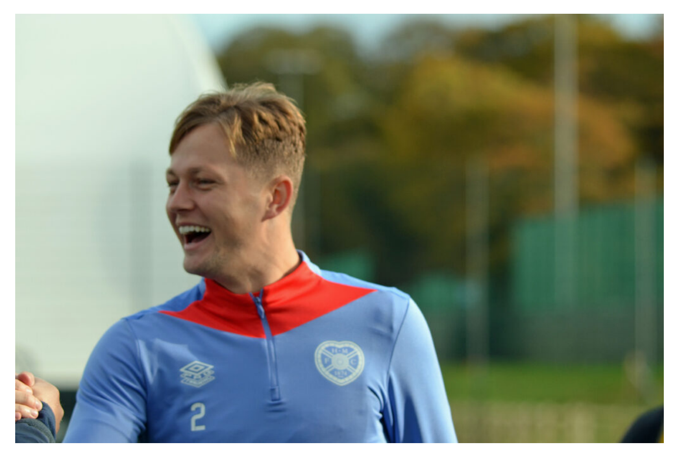
PICTURES: All taken at training at Riccarton on Friday ahead of the St Mirren clash.