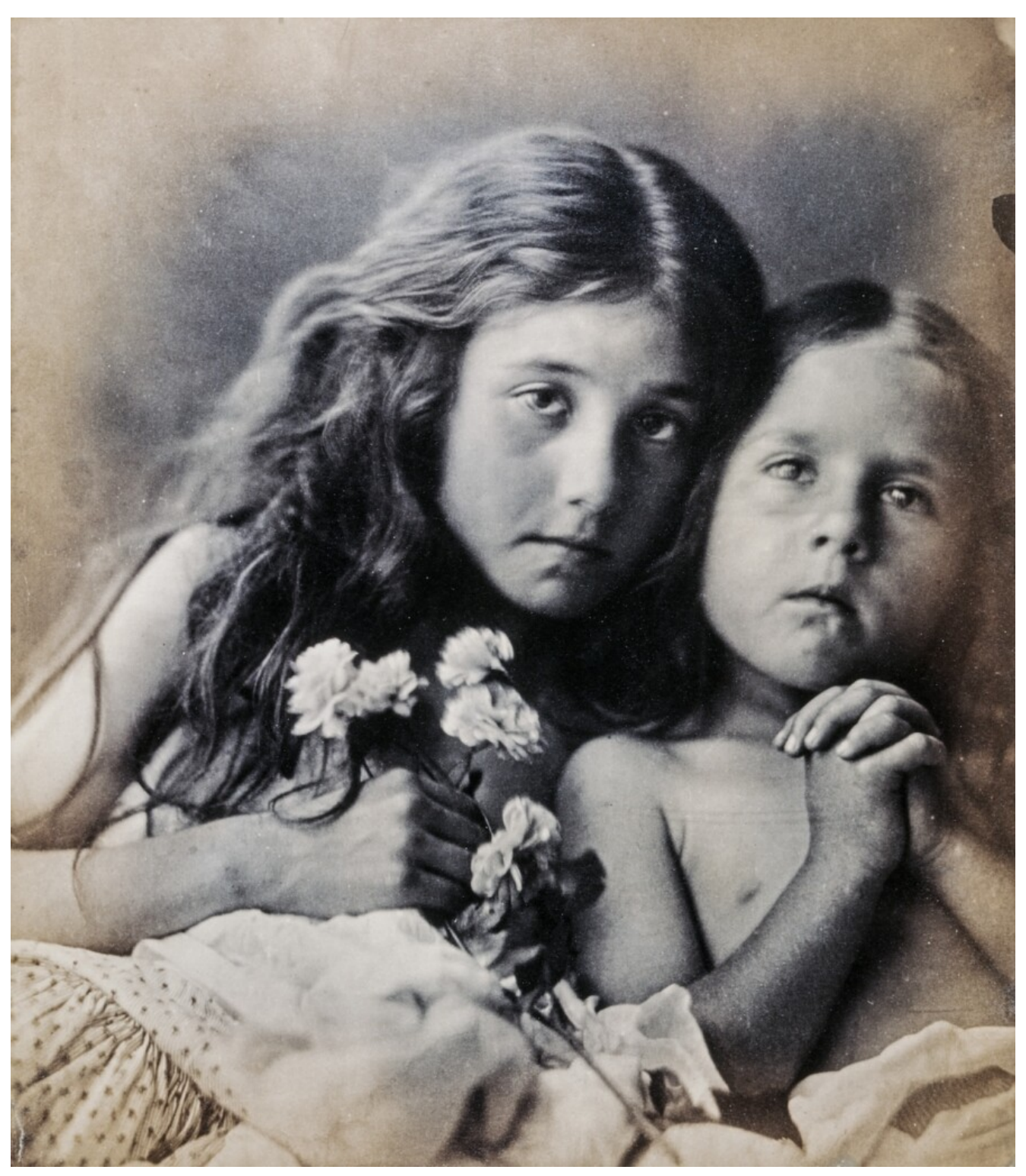
Julia Margaret Cameron The red and white roses