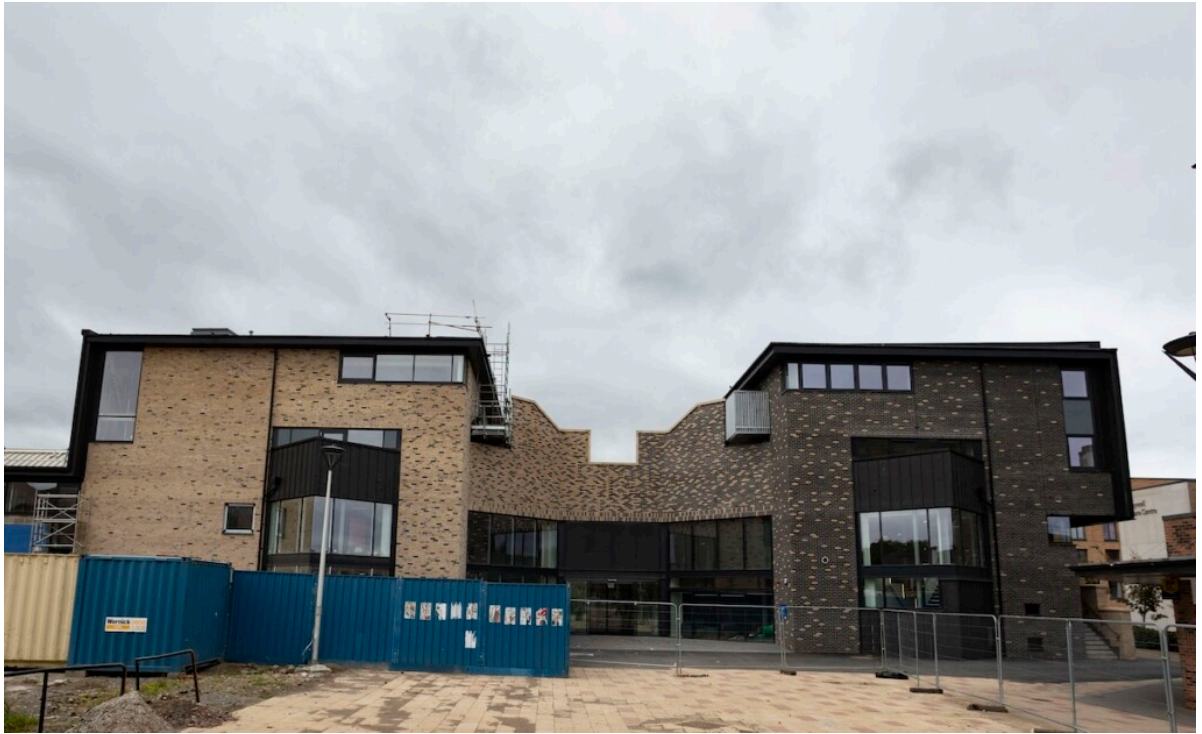
Pennywell Early Learning and Childcare Centre and North Edinburgh Arts on left at Macmillan Square.