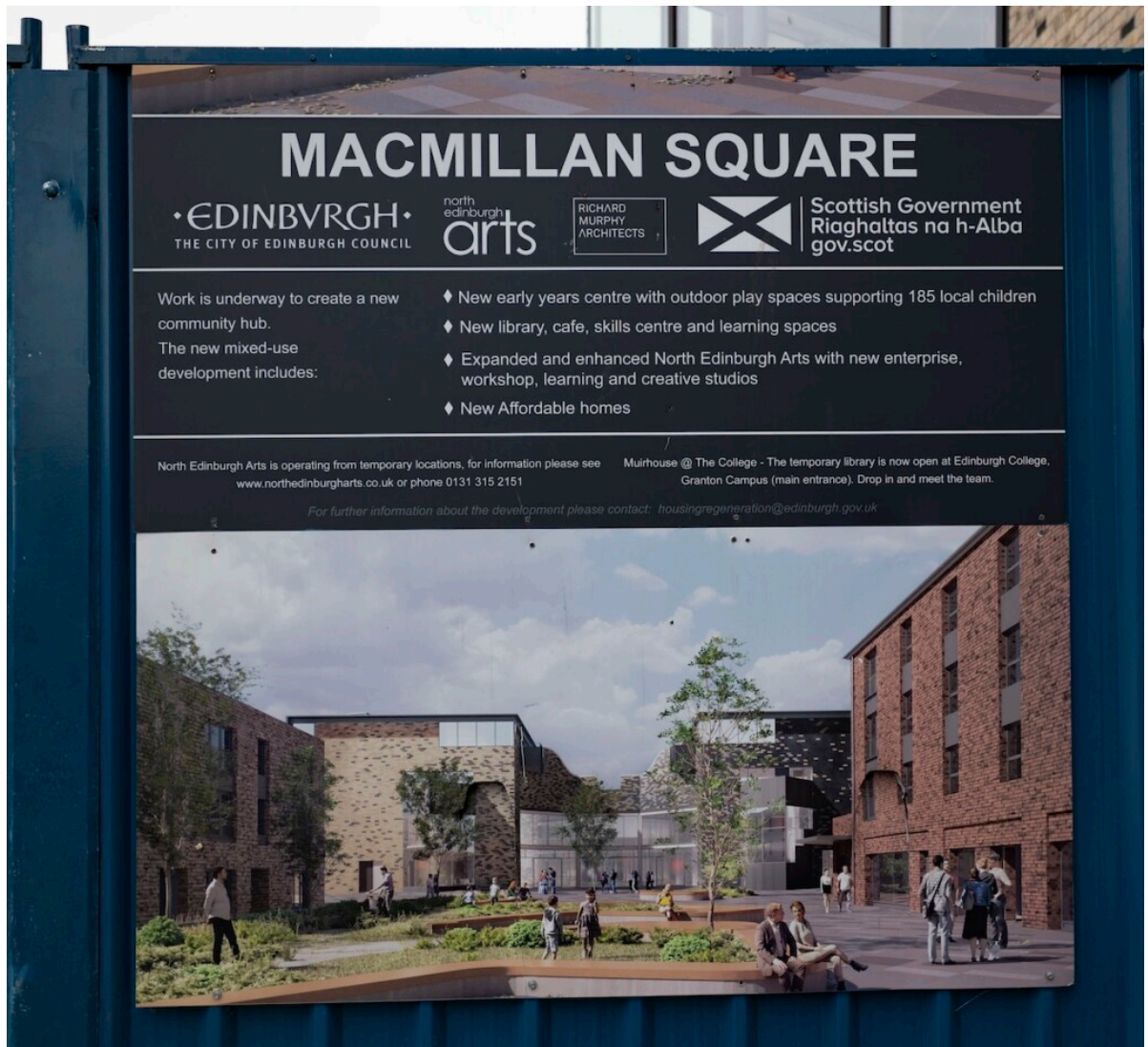
Pennywell Early Learning and Childcare Centre and North Edinburgh Arts on left at Macmillan Square.