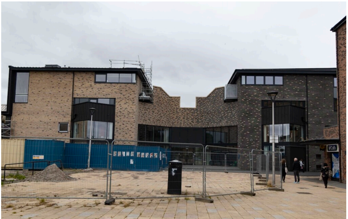
Pennywell Early Learning and Childcare Centre and North Edinburgh Arts on left.