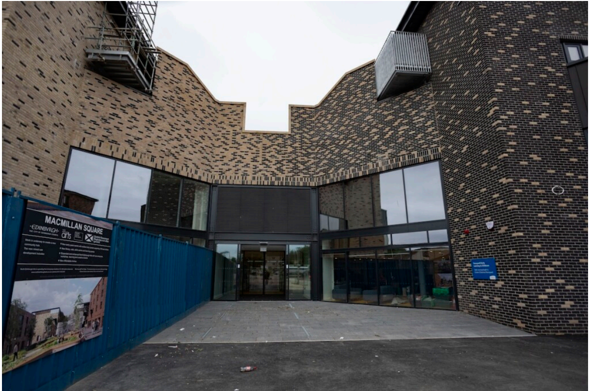
Pennywell Early Learning and Childcare Centre and North Edinburgh Arts on left at Macmillan Square.