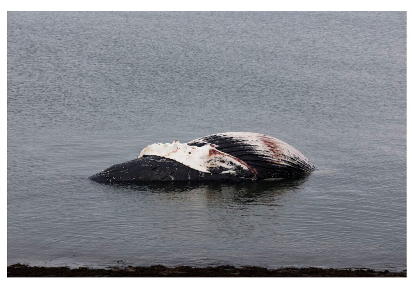
29/9/2024 Dead whale is lying in the water off Newhaven.