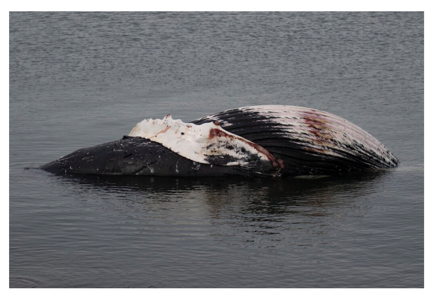
29/9/2024 Dead whale is lying in the water off Newhaven.