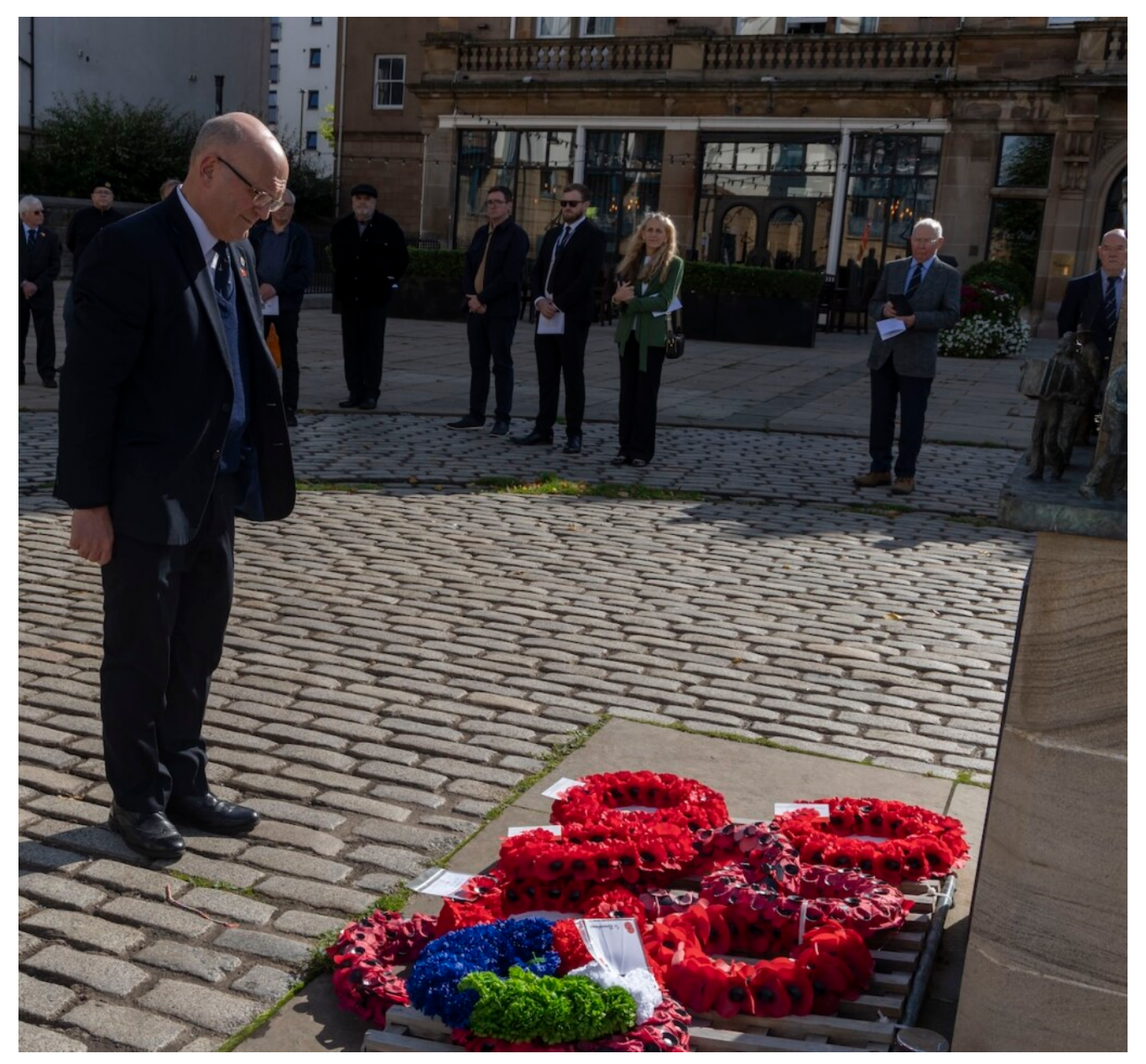
At Merchant Navy Day at the Merchant Navy Memorial Leith Edinburgh.