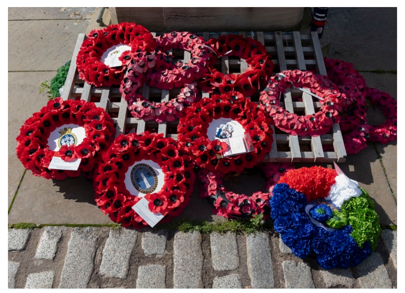
Merchant Navy Day at the Merchant Navy Memorial Leith Edinburgh.