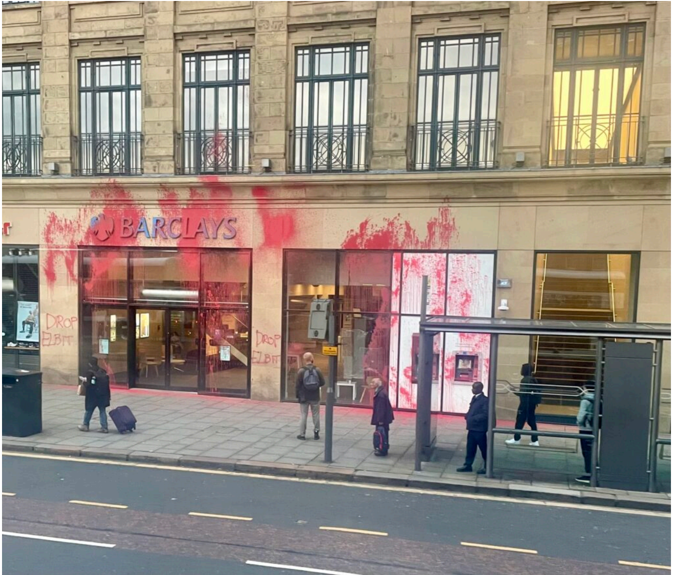
This follows action involving red paint at the Barclays office in Melville Crescent earlier in the summer.