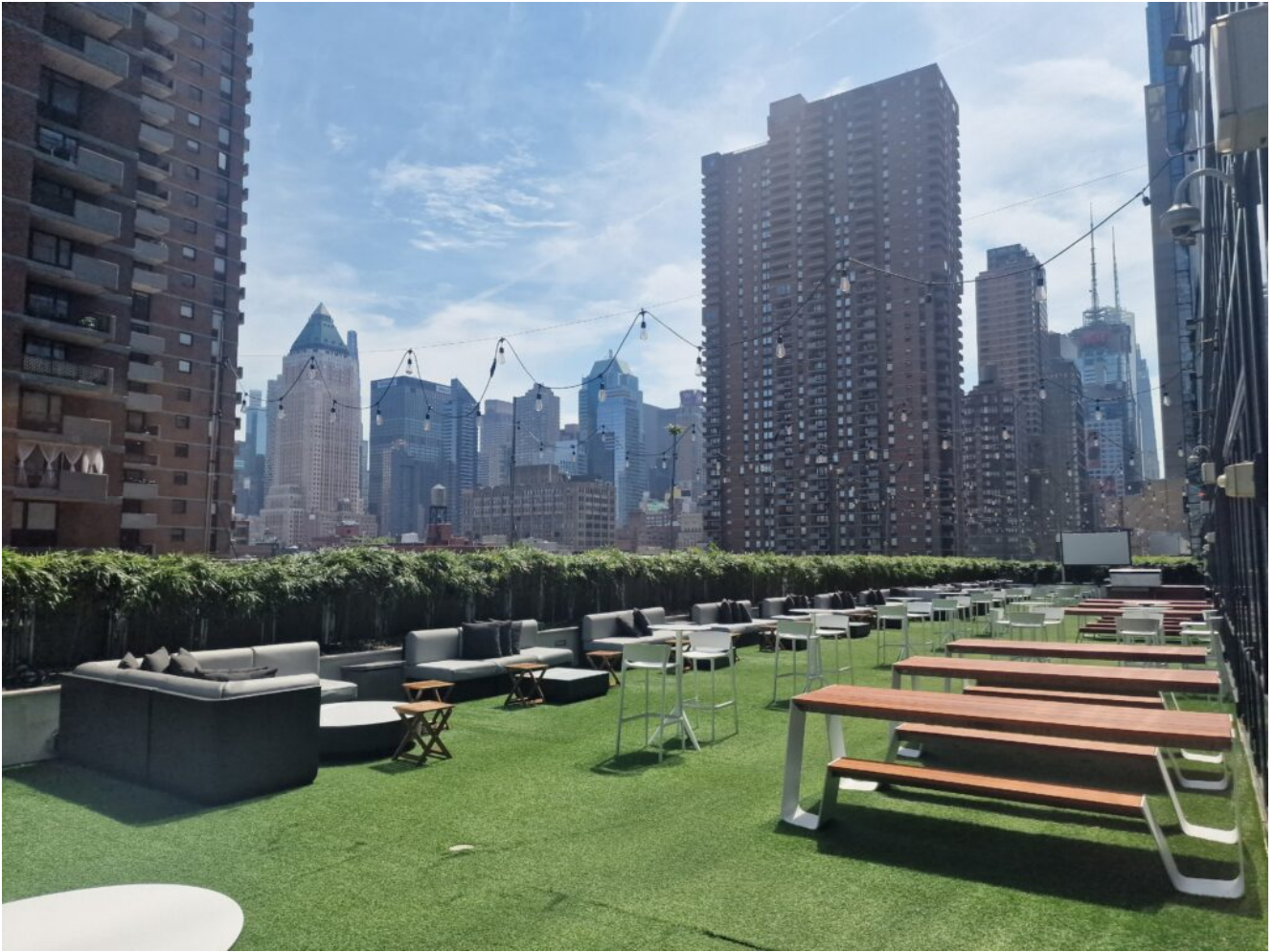
YOTEL Times Square terrace