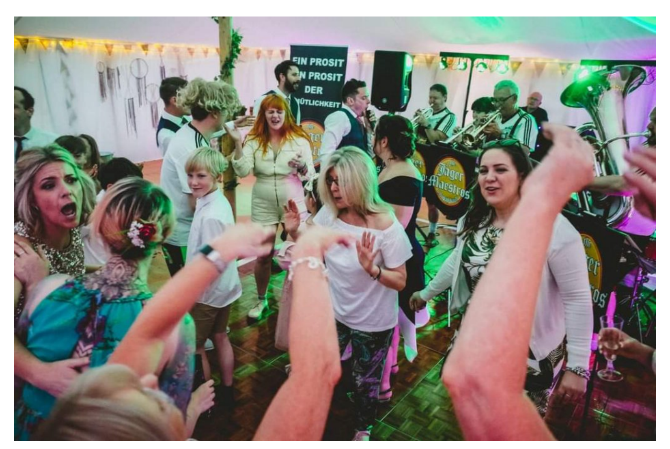
Jager Maestros will have the Oktoberfest party in full swing

The <u>Jager Maestros</u> — a German Oompah Band — features seven of the country's finest brass players and will get the afternoon underway with a mesmerising journey through Oktoberfest songs and games. A past sell-out act at the Edinburgh Fringe, they are in demand at Oktoberfests throughout Europe and have been a hit with audiences across the UK.