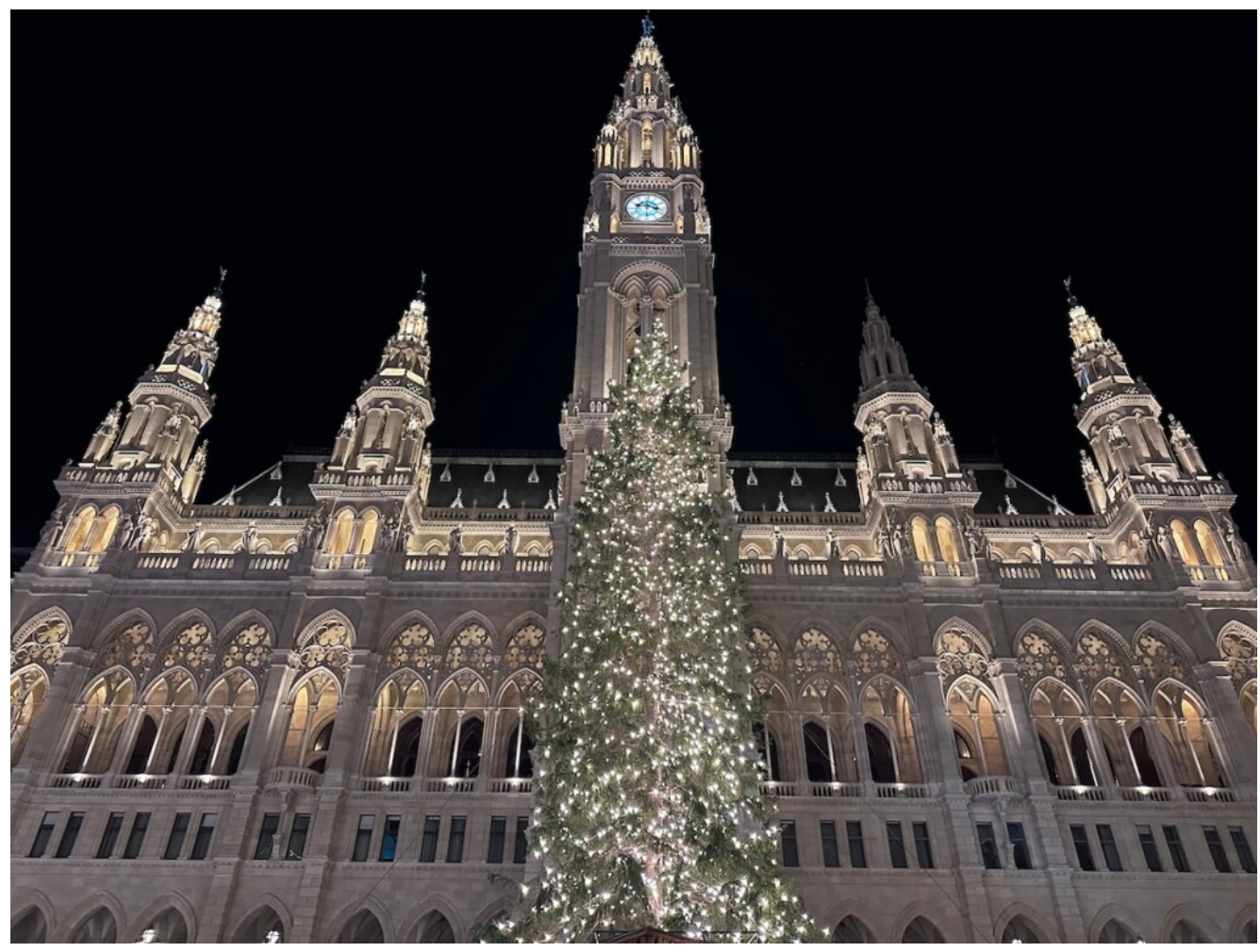
Town Hall Vienna