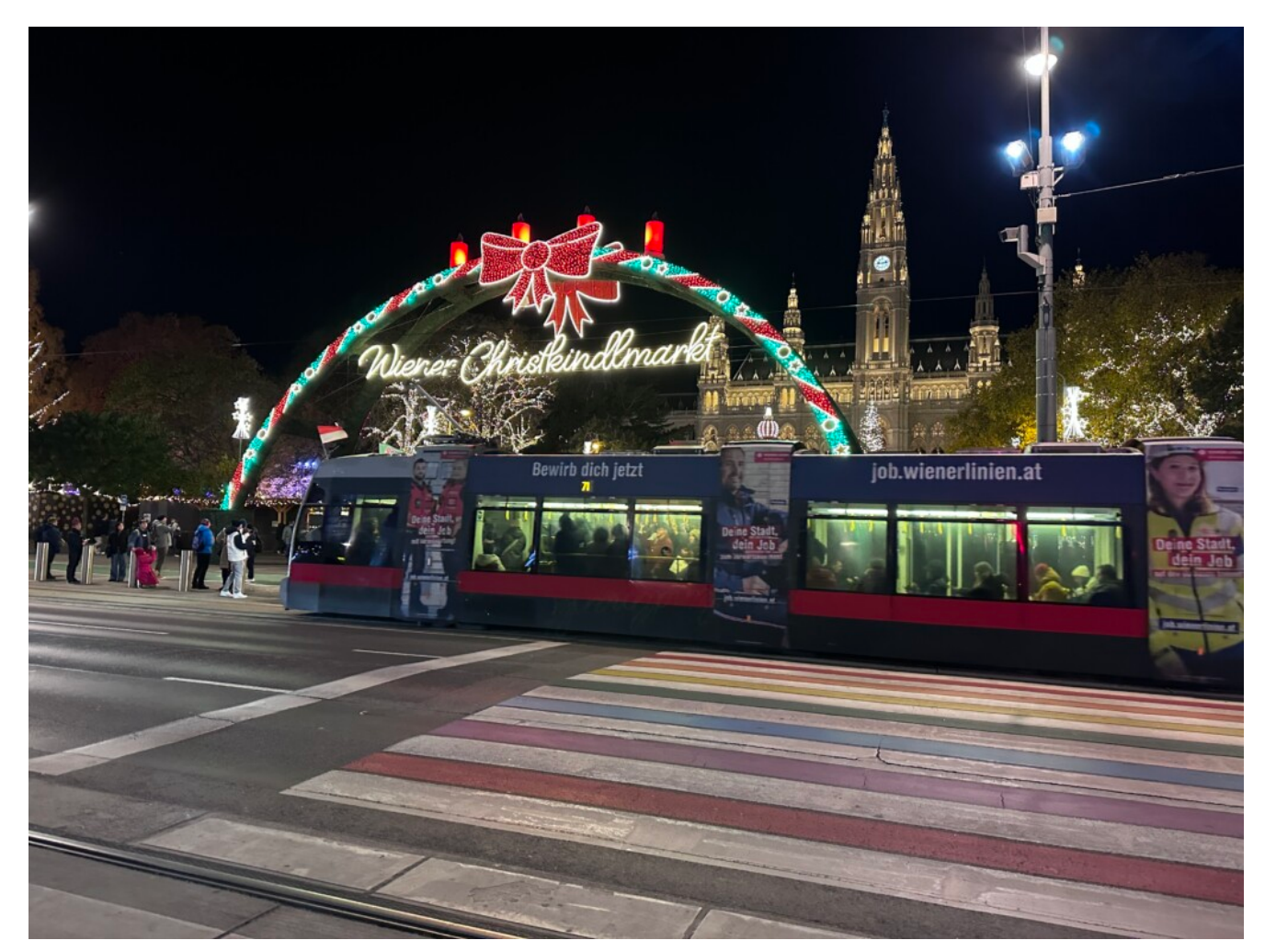
Christmas Market in Vienna

For further information and to book visit <a href="https://www.jet2.com">www.jet2.com</a> or <a href="https://www.jet2citybreaks.com">www.jet2citybreaks.com</a>