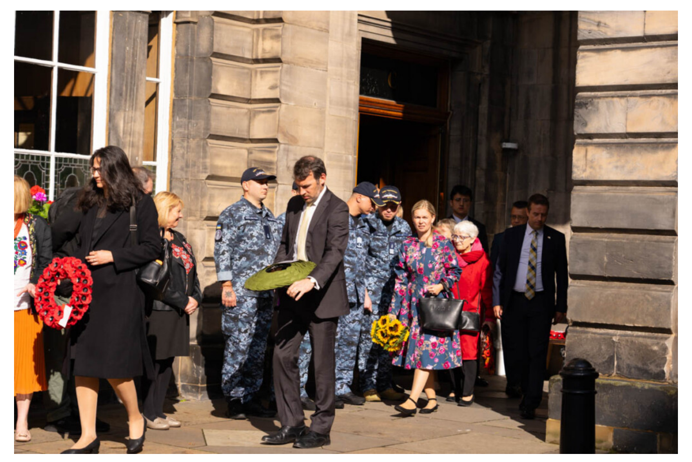
The consular corps at the City Chambers to mark Ukraine Day of Independence