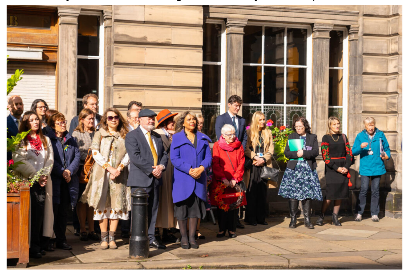
Colin Beattie MSP and Kaukab Stewart MSP Minister for Equalities at the City Chambers marking Ukraine Day of Independence 2024

Some of the consular corps and Ukrainians living in Edinburgh at the City Chambers marking Ukraine Day of Independence 2024