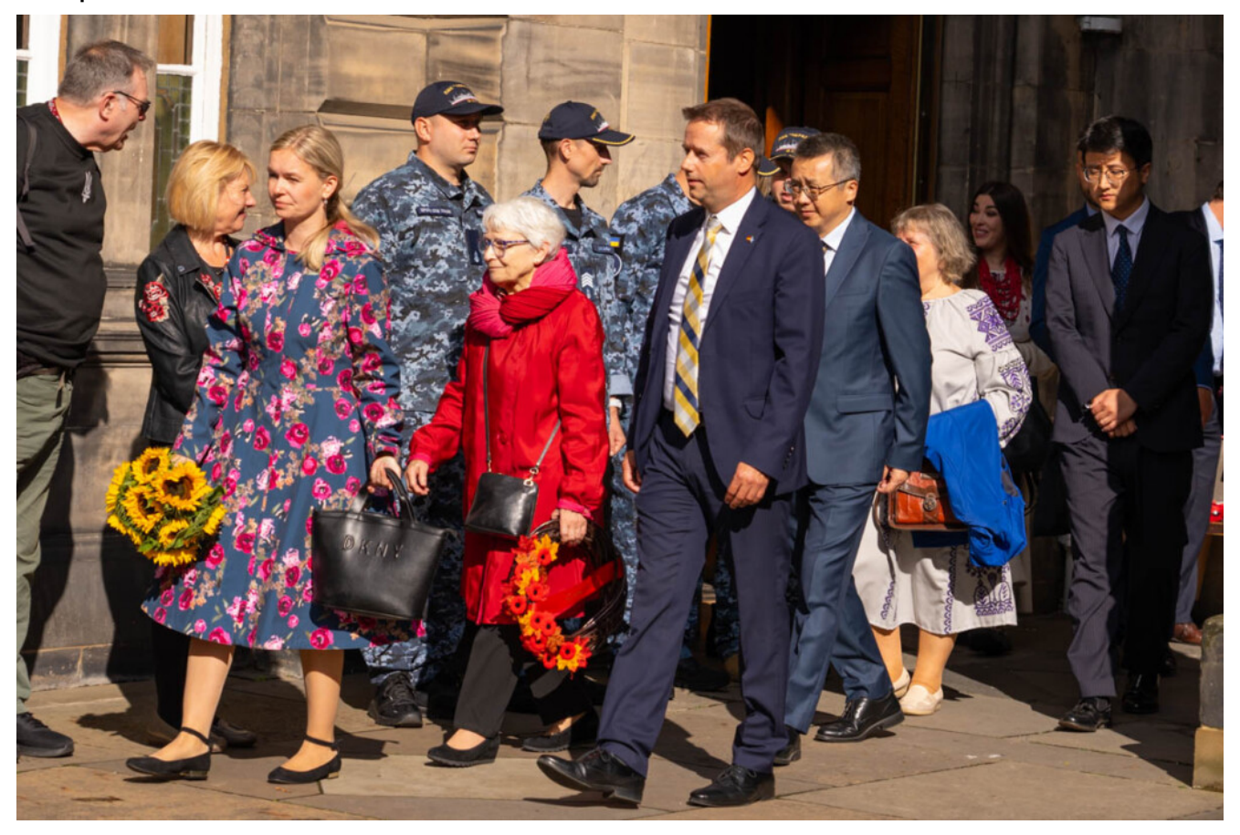
The consular corps at the City Chambers to mark Ukraine Day of Independence