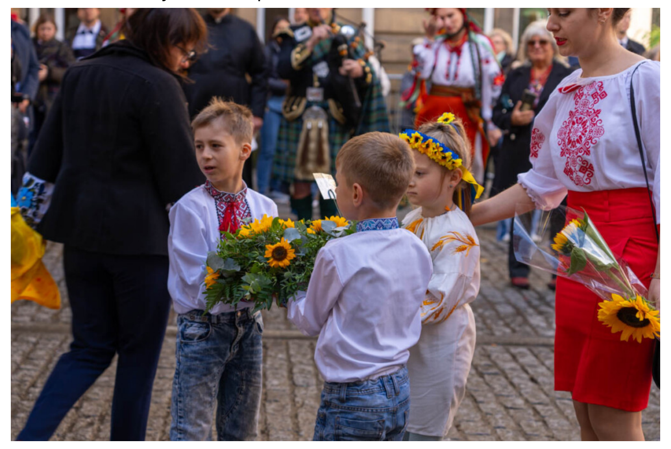
Children at the City Chambers laying wreaths to mark Ukraine Day of Independence 2024