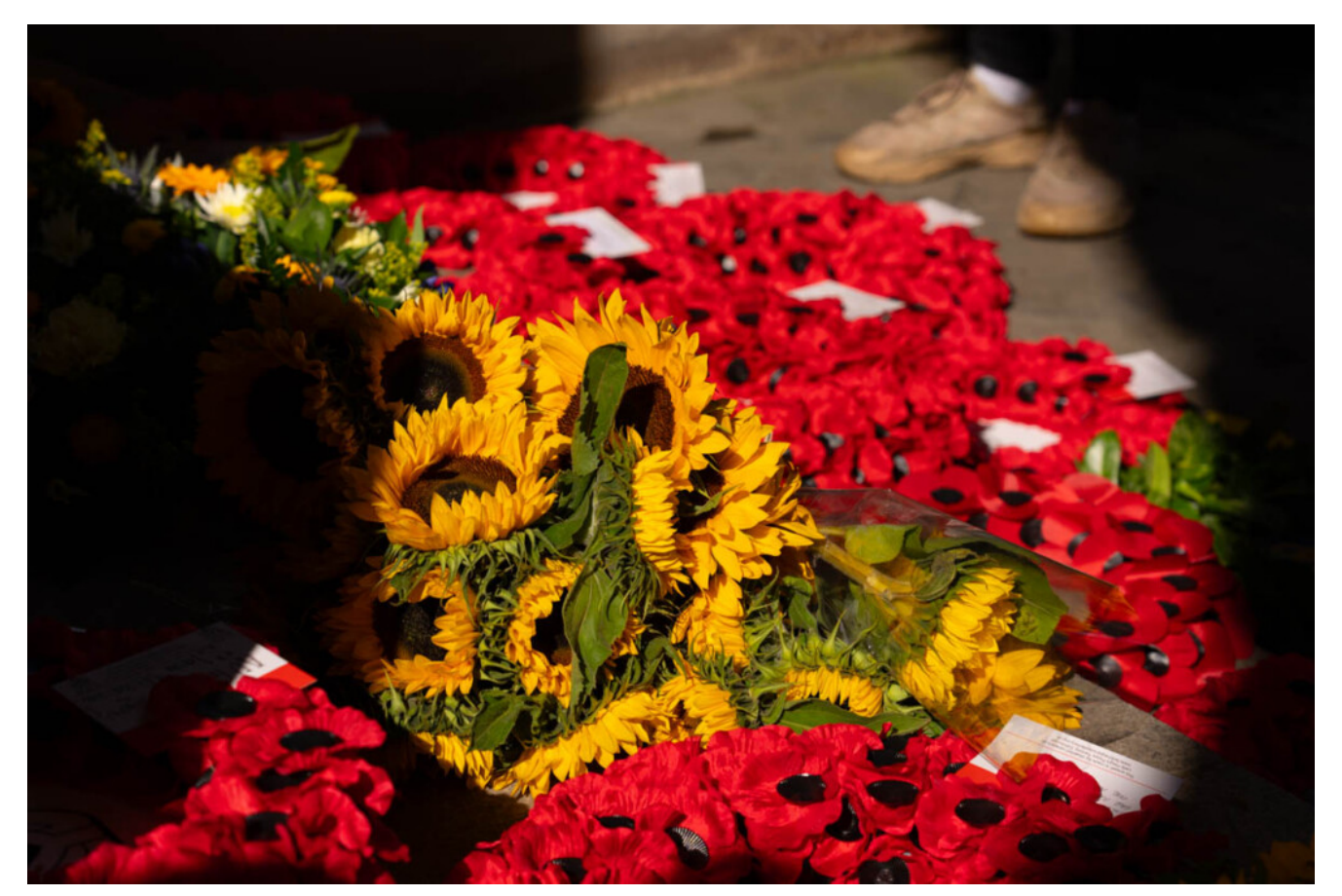
At the City Chambers wreaths to mark Ukraine Day of Independence 2024