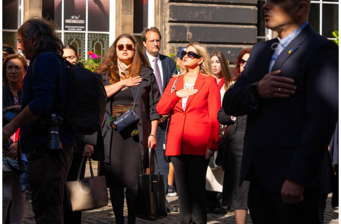
At the City Chambers after laying wreaths to mark Ukraine Day of Independence 2024