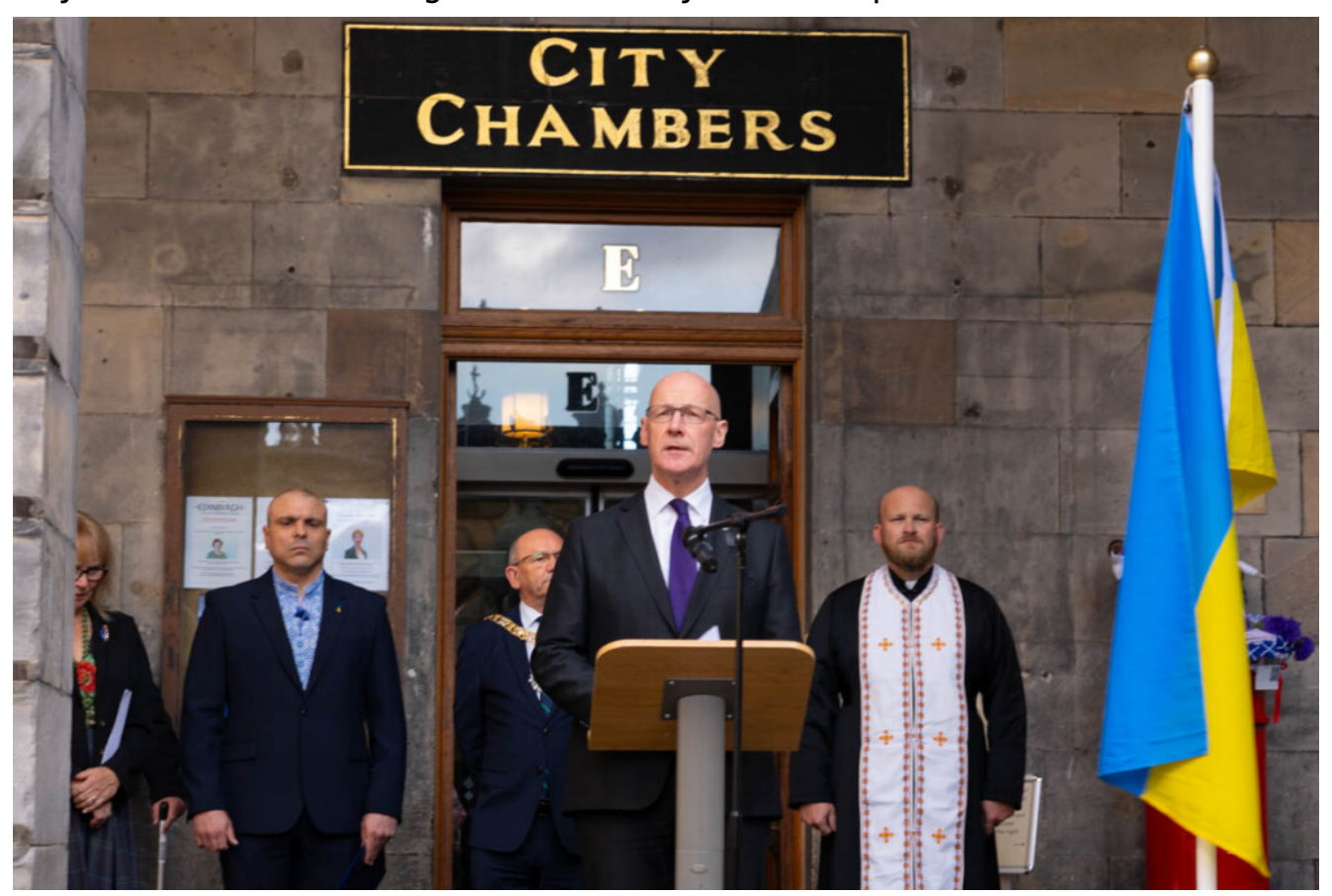
The Rt Hon John Swinney speaking at the City Chambers marking Ukraine Day of Independence 2024

Consul of Ukraine in Edinburgh Andrii Kuslii speaking at the City Chambers marking Ukraine Day of Independence 2024