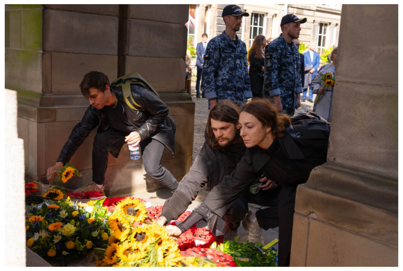
At the City Chambers wreaths to mark Ukraine Day of Independence 2024