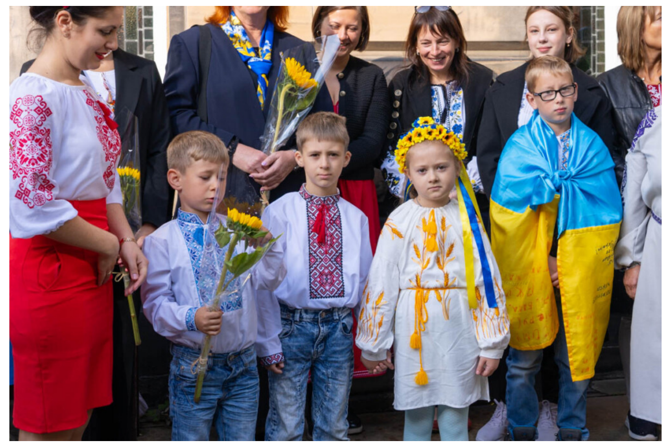
At the City Chambers to mark Ukraine Day of Independence