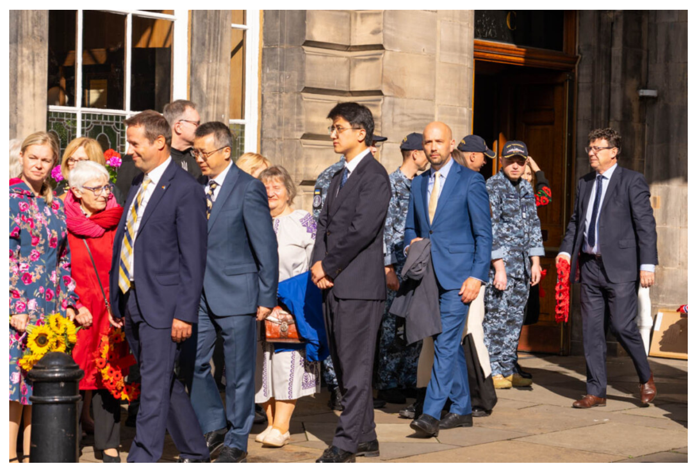
The consular corps at the City Chambers to mark Ukraine Day of Independence