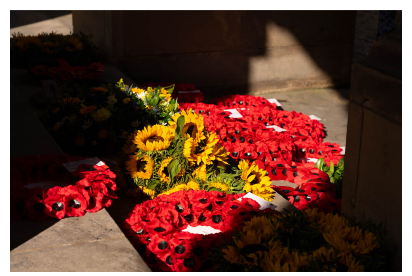
At the City Chambers wreaths to mark Ukraine Day of Independence 2024