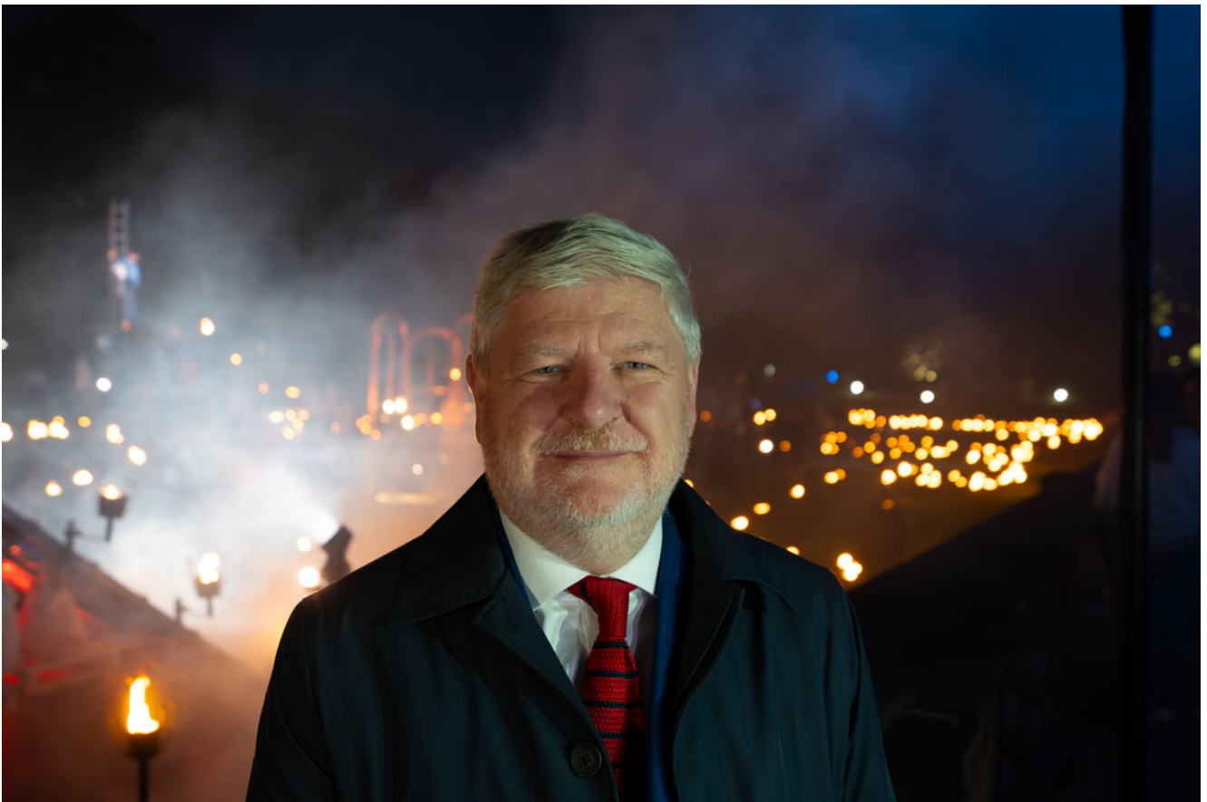
Angus Robertson MSP, Cabinet Secretary for the Constitution, External Affairs and Culture at the Opening Event.