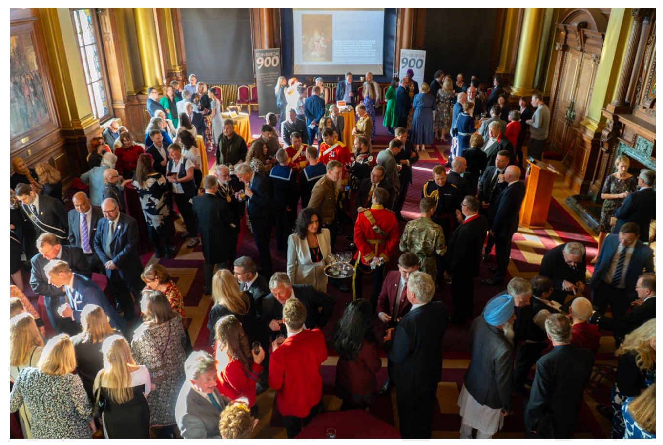
Edinburgh 900 event May 2024