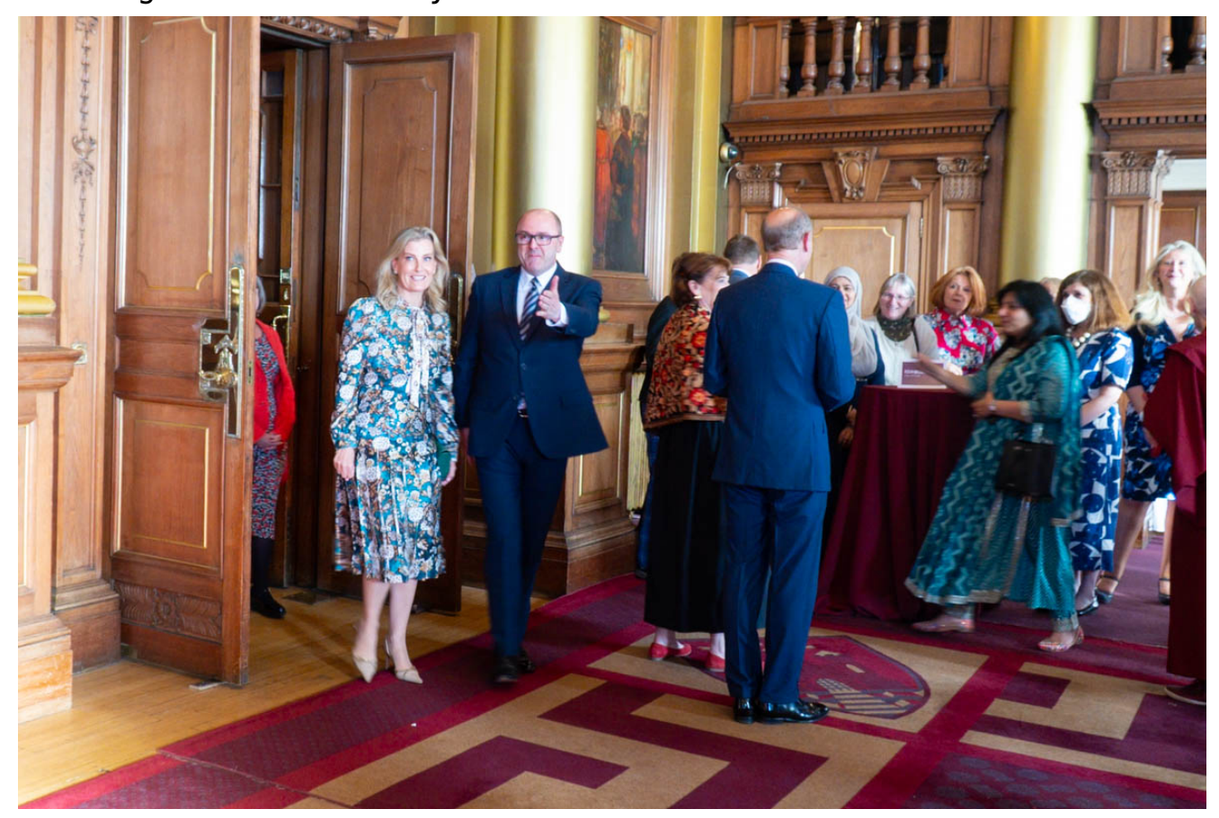
\ensuremath{\mathsf{TRH}} The Duke and Duchess of Edinburgh arriving in the City Chamber