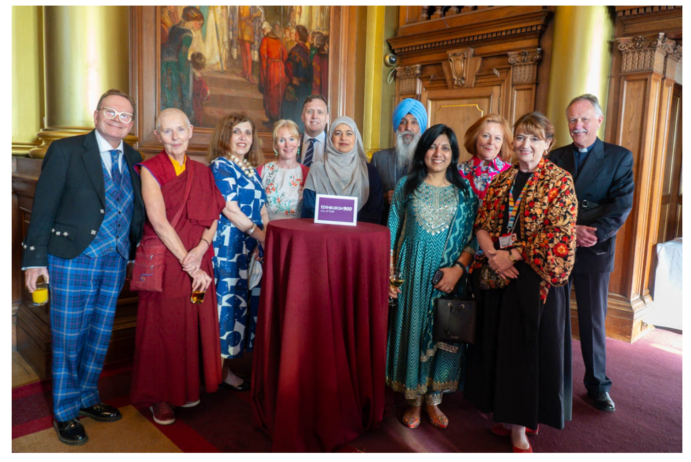
The Inter-Faith table at Edinburgh 900 event May 2024