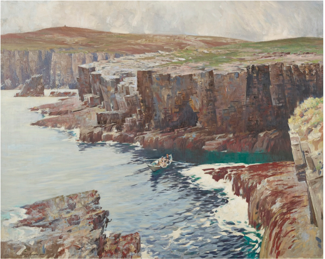
Stanley Cursiter, CBE, RSA, RSW A Rockbound Coast