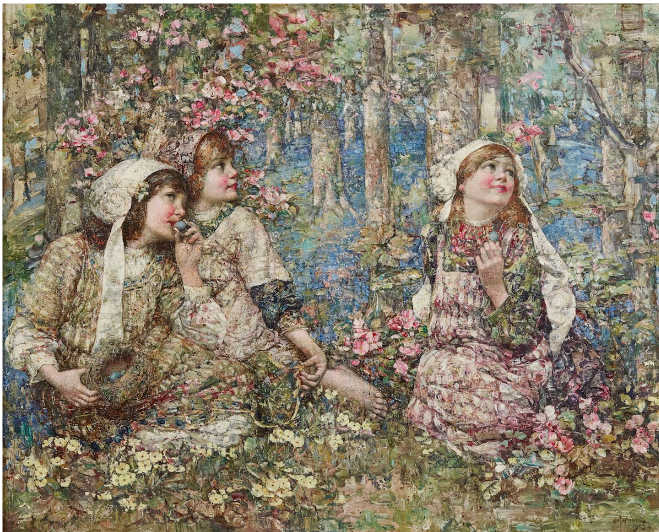
Edward Atkinson Hornel Voices in the Woodland

Work by Sir John Lavery is currently on show at the huge exhibition in the National Galleries of Scotland.