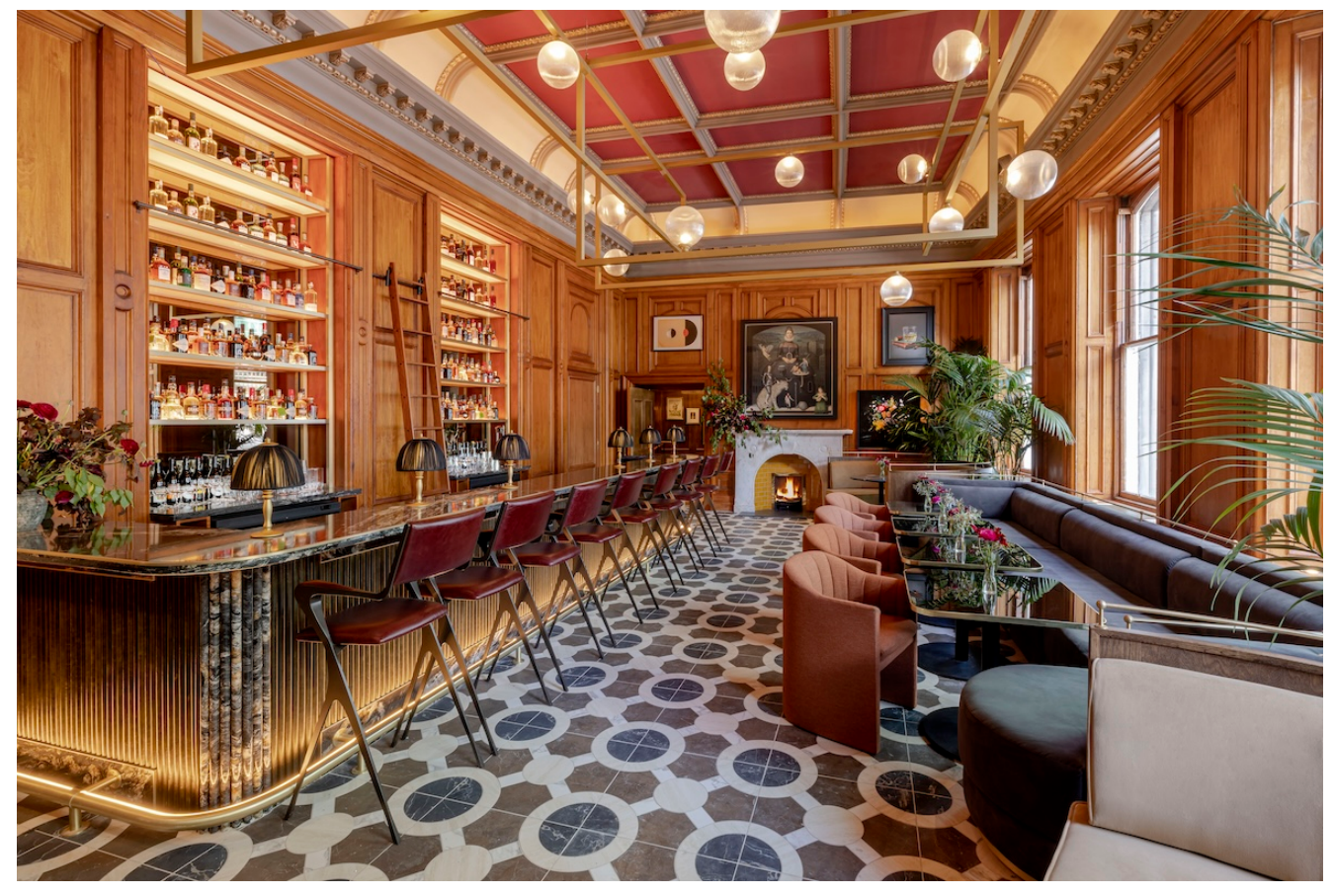
Commons Club Bar