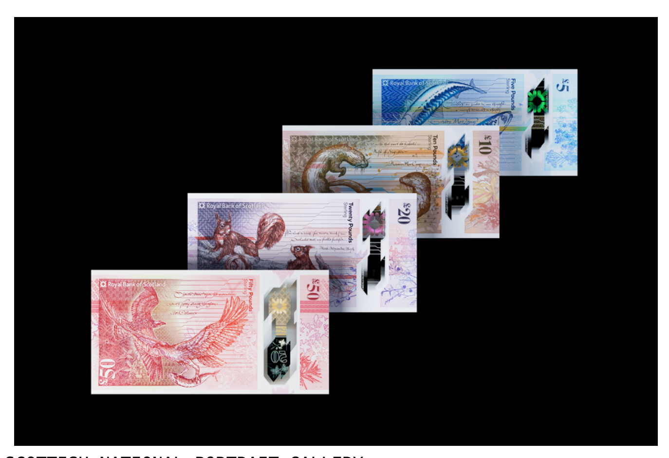
SCOTTISH NATIONAL PORTRAIT GALLERY

across the pioneering 'Fabric of Nature' series of bank notes. Considered to be pocket size works of art, the unique campaign sees notes that are full of meaning and part of a monetary family celebrating the people, achievements and nature of Scotland. In keeping with the unmistakable world of Timorous Beasties — where plants, animals and society are visually inextricable — the studio's illustrative work can be seen across otters, mackerel, red squirrels, and of course, midges!