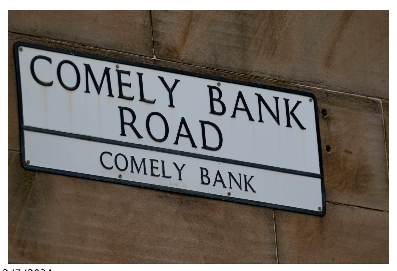
2/7/2024 A grenade was found in front garden of a house in Comely Bank Road Edinburgh.