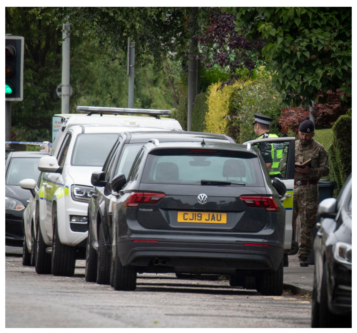
2/7/2024 A grenade was found in front garden of a house in Comely Bank Road Edinburgh.