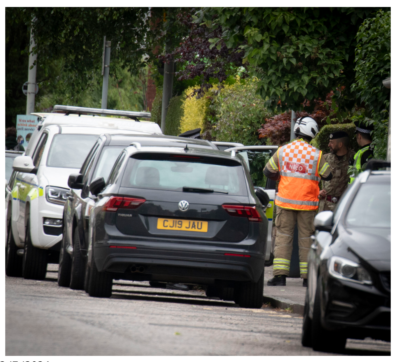
2/7/2024 A grenade was found in front garden of a house in Comely Bank Road Edinburgh.