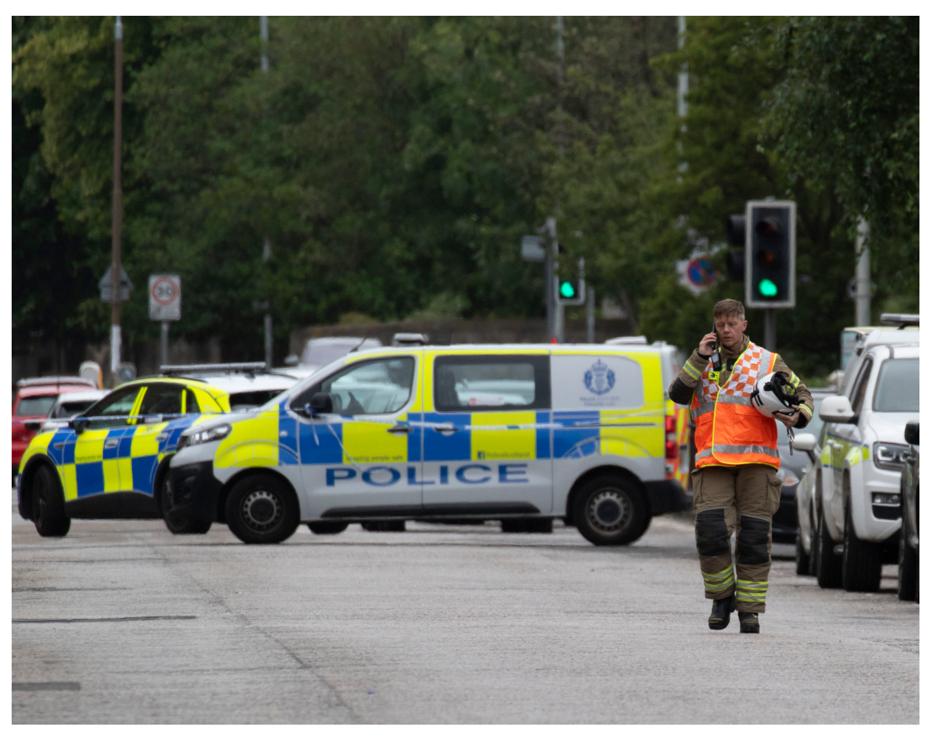
2/7/2024 A grenade was found in front garden of a house in Comely Bank Road Edinburgh.