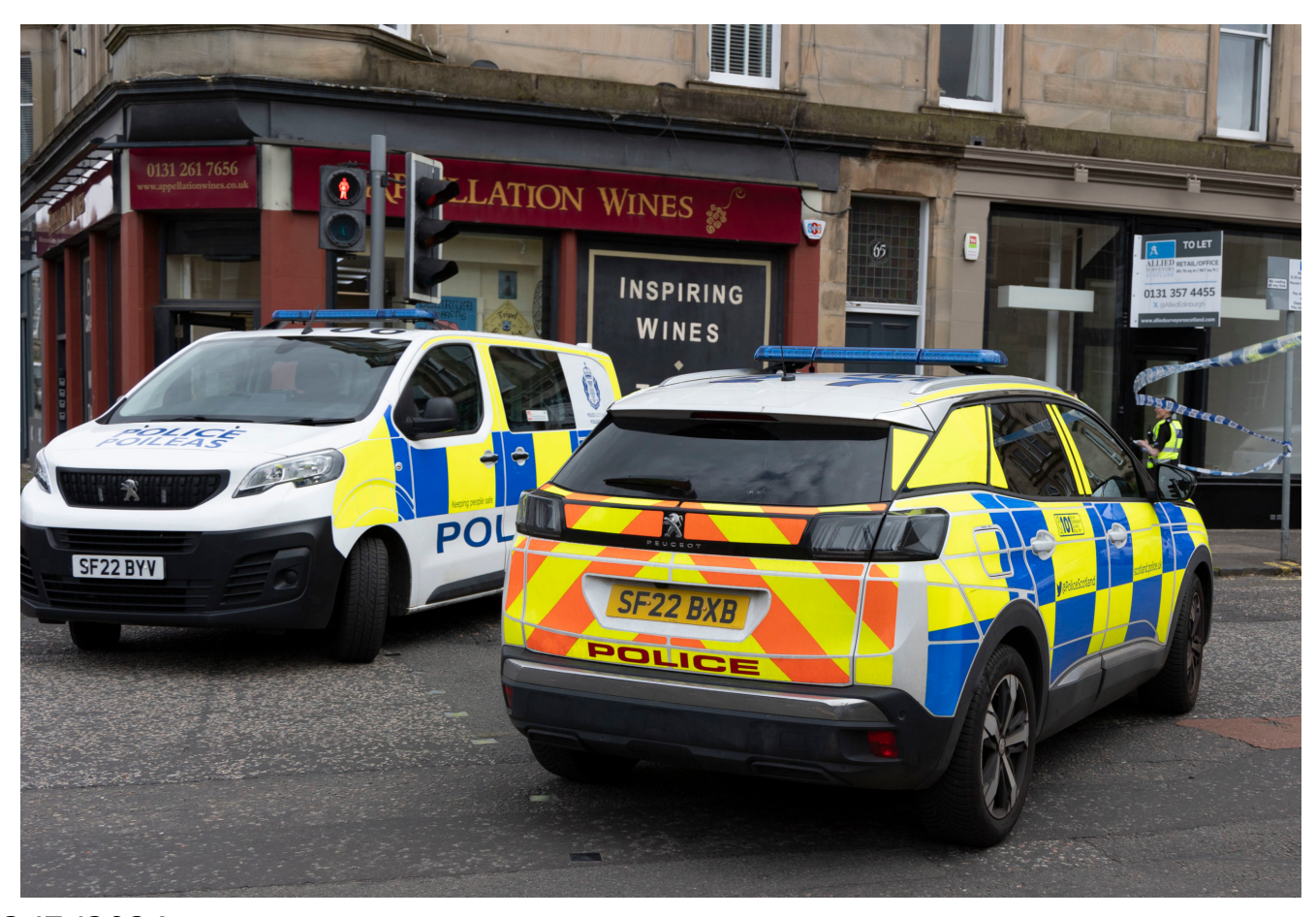
2/7/2024 A grenade was found in front garden of a house in Comely Bank Road Edinburgh.