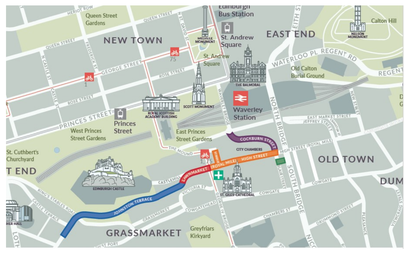
These are the streets affected:

This week some streets in the Old Town are being closed for the rest of the summer to accommodate pedestrian traffic which increases so much during the Festival. Others are then closed or pedestrian and vehicle access may be altered from the end of the month.