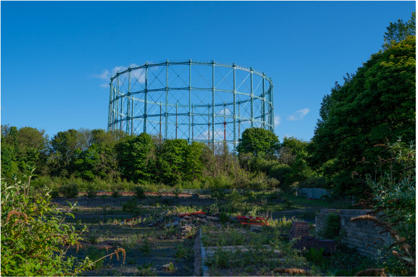
The Granton Gasholder.