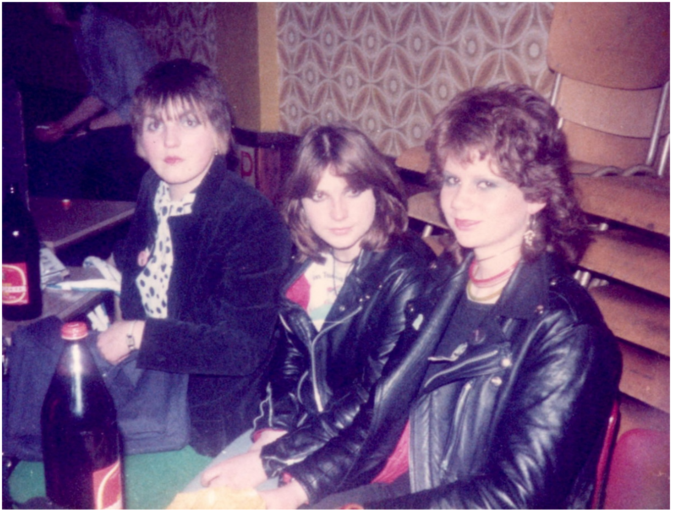
Since Yesterday promo still The Ettes