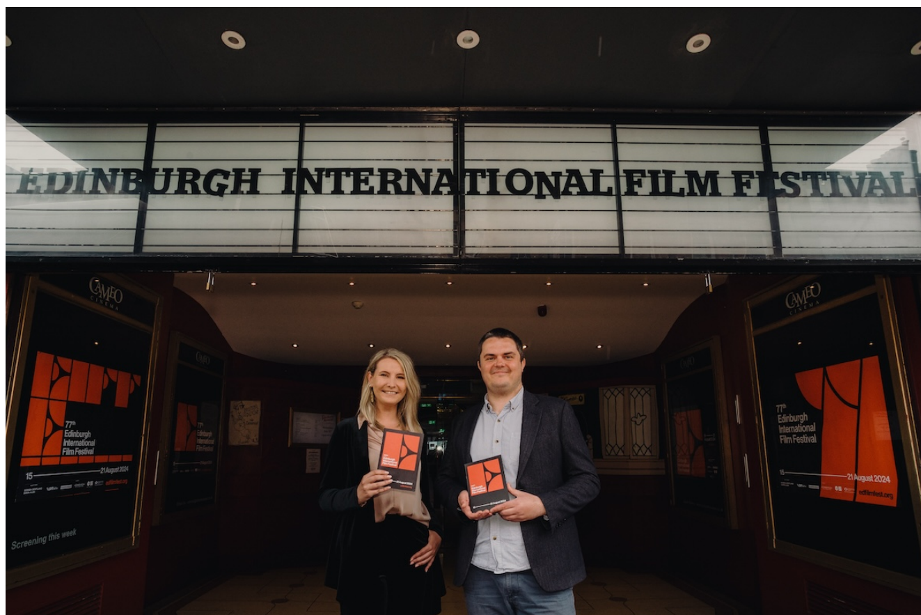
EIFF 2024: Programme Launch Pic shows EIFF Festival Producer

Complementing the Opening Night film, Nora Fingscheidt's THE OUTRUN starring Saoirse Ronan, the Festival has a selection of compelling new and established voices in cinema with World and UK premieres to entertain audiences this August.