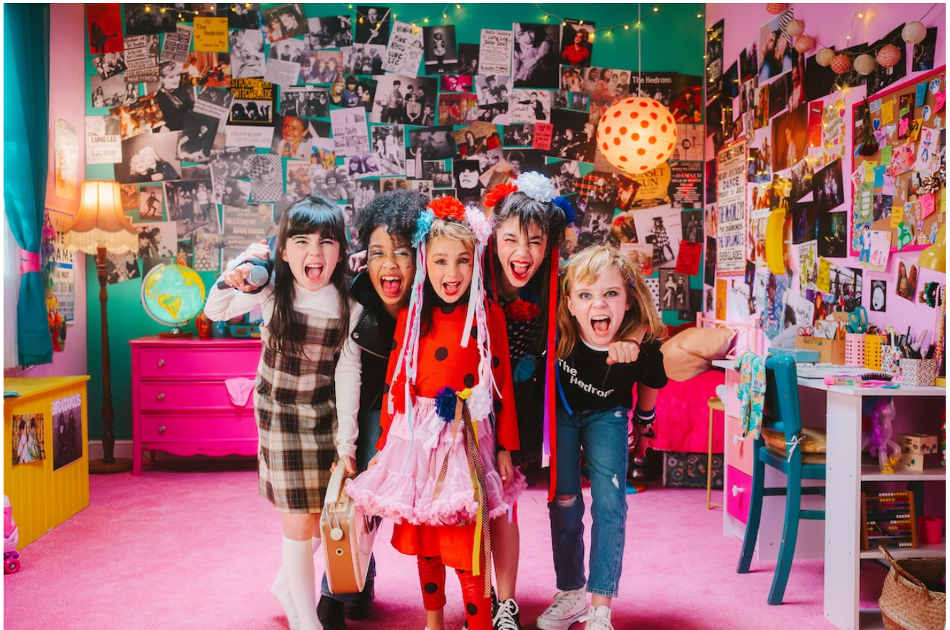
Since Yesterday promo still