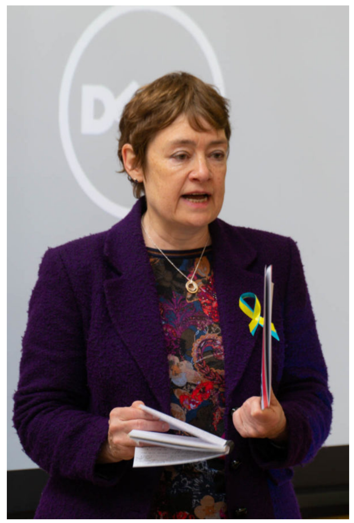
Sarah Boyack Launch of 2022 Edinburgh Labour Manifesto at Coffee Saints