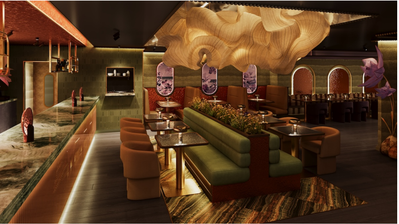
A CGI image of Somewhere