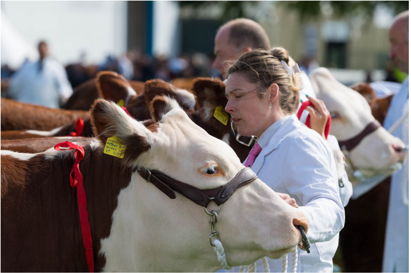
The Royal Highland Show 2024