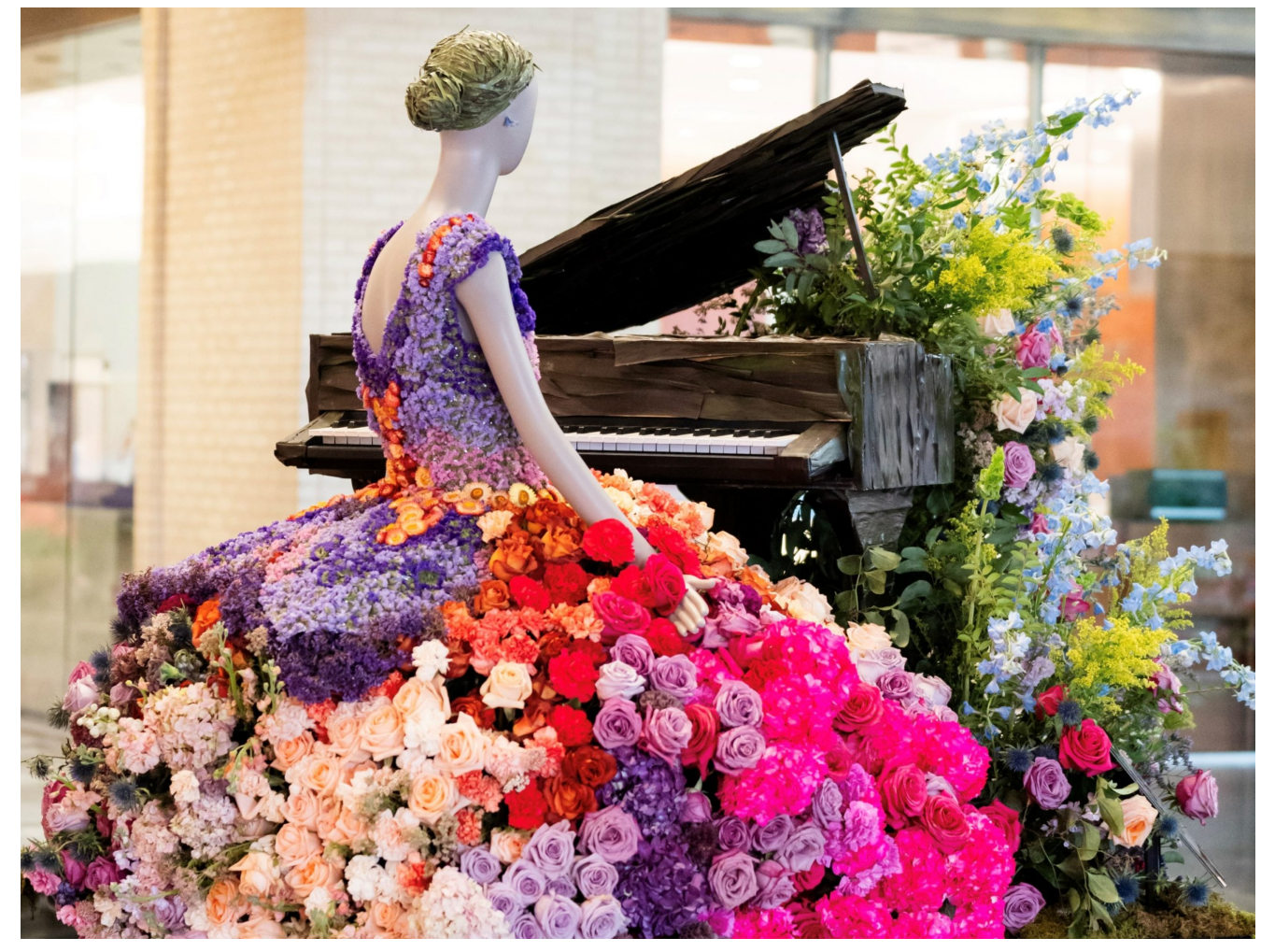
Fleurs de Villes ARTISTE