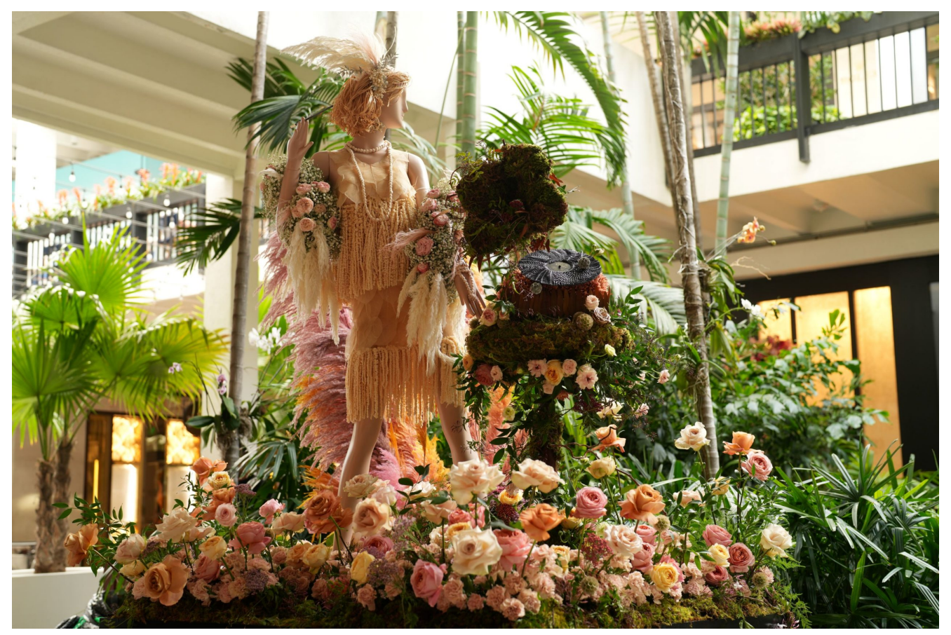
Fleurs de Villes ARTISTE