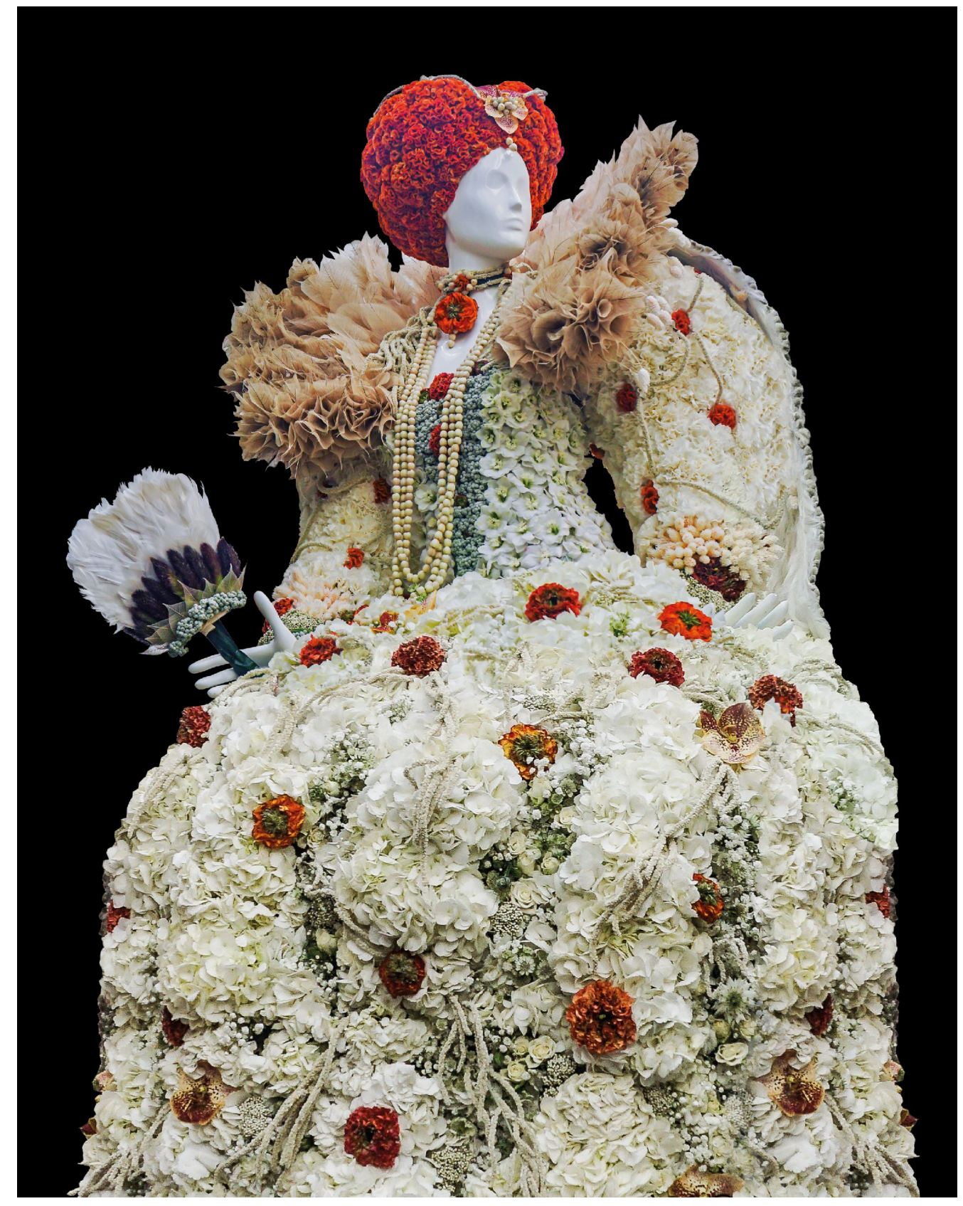
Fleurs de Villes ARTISTE