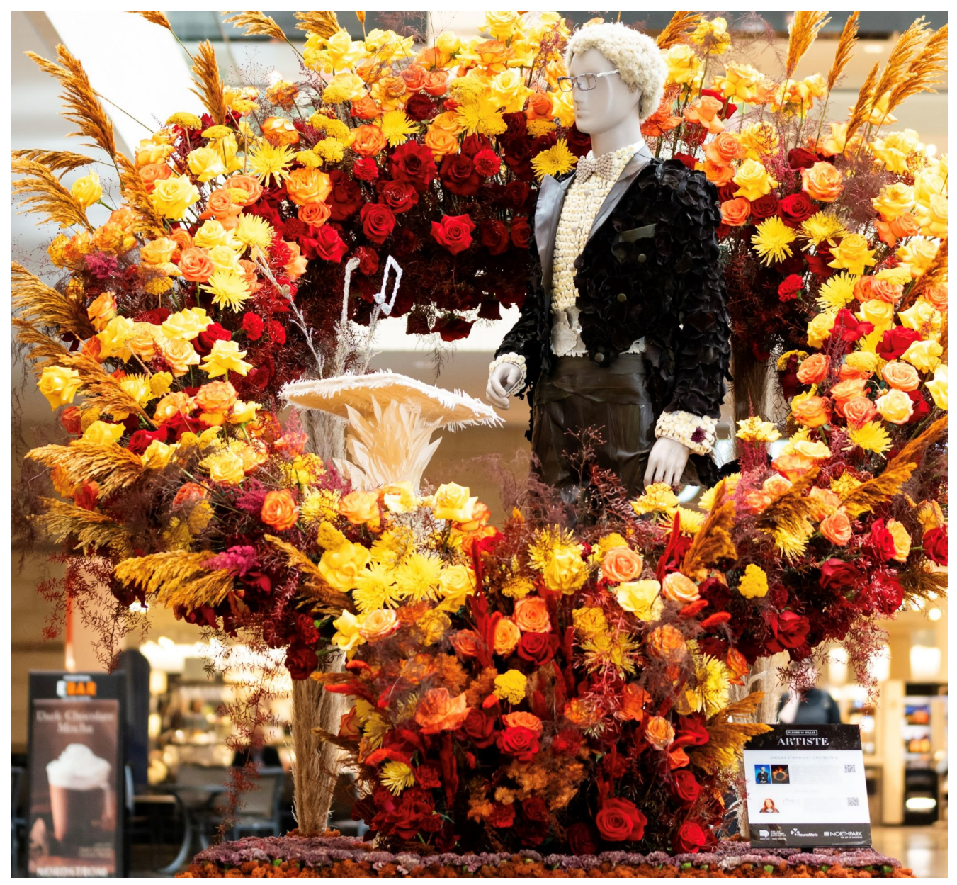
Fleurs de Villes ARTISTE