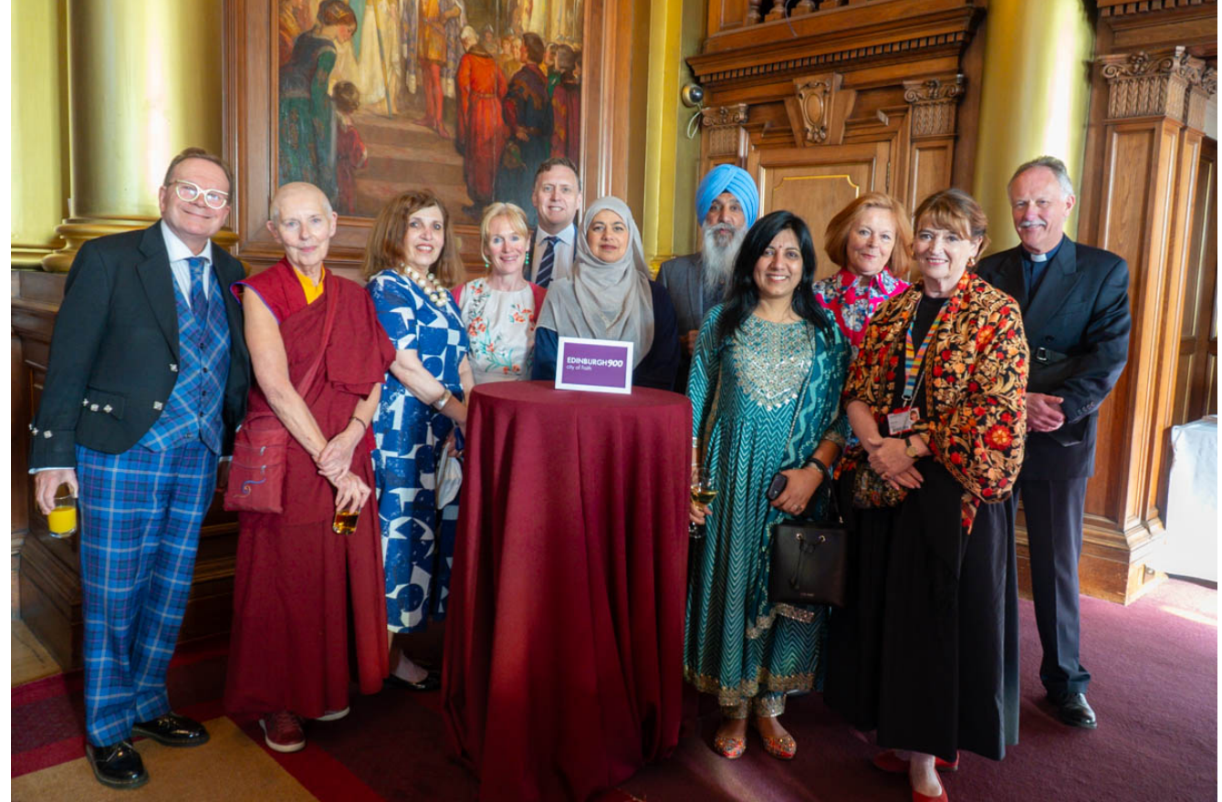
The Inter-Faith table