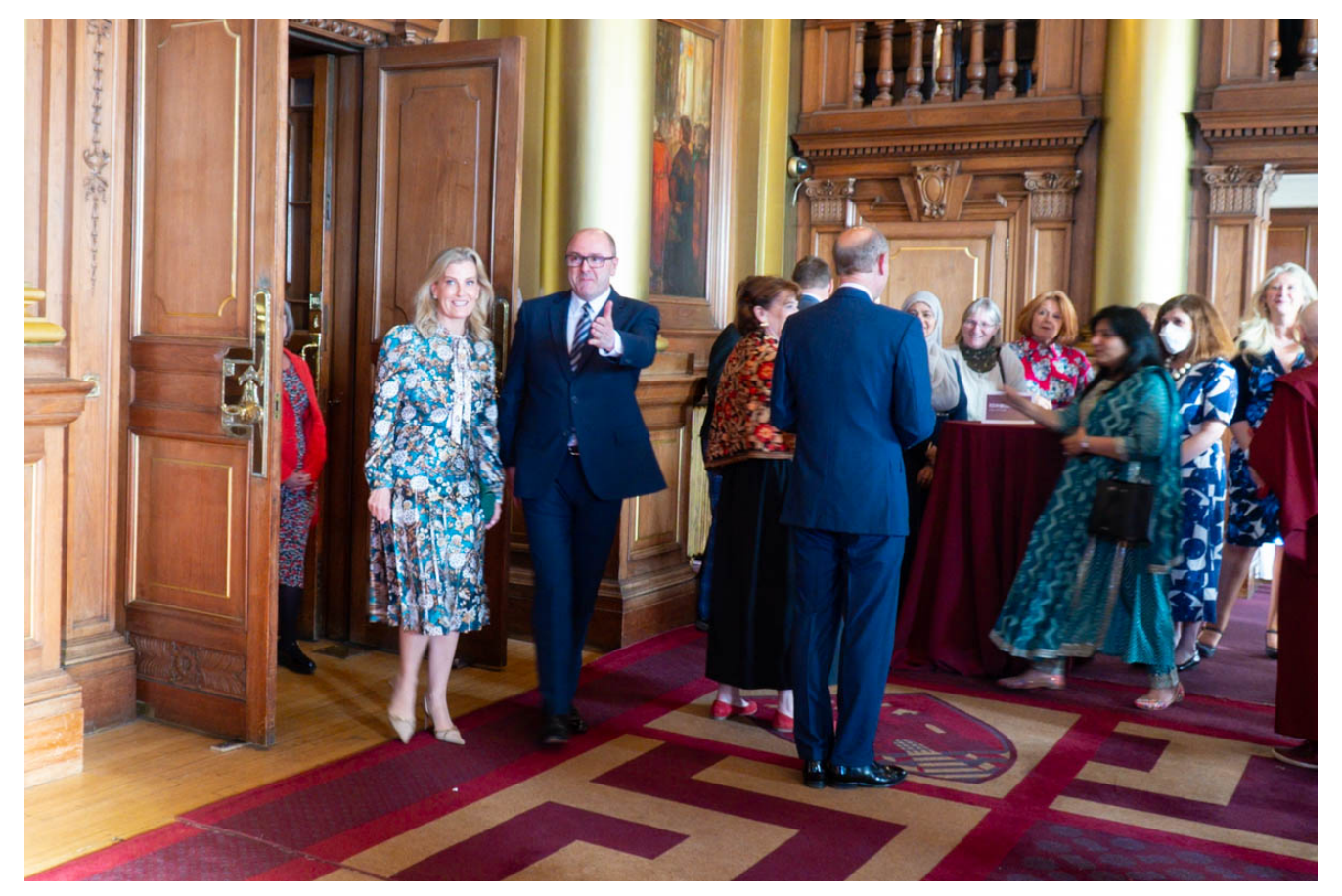
TRH The Duke and Duchess of Edinburgh arriving in the City Chamber