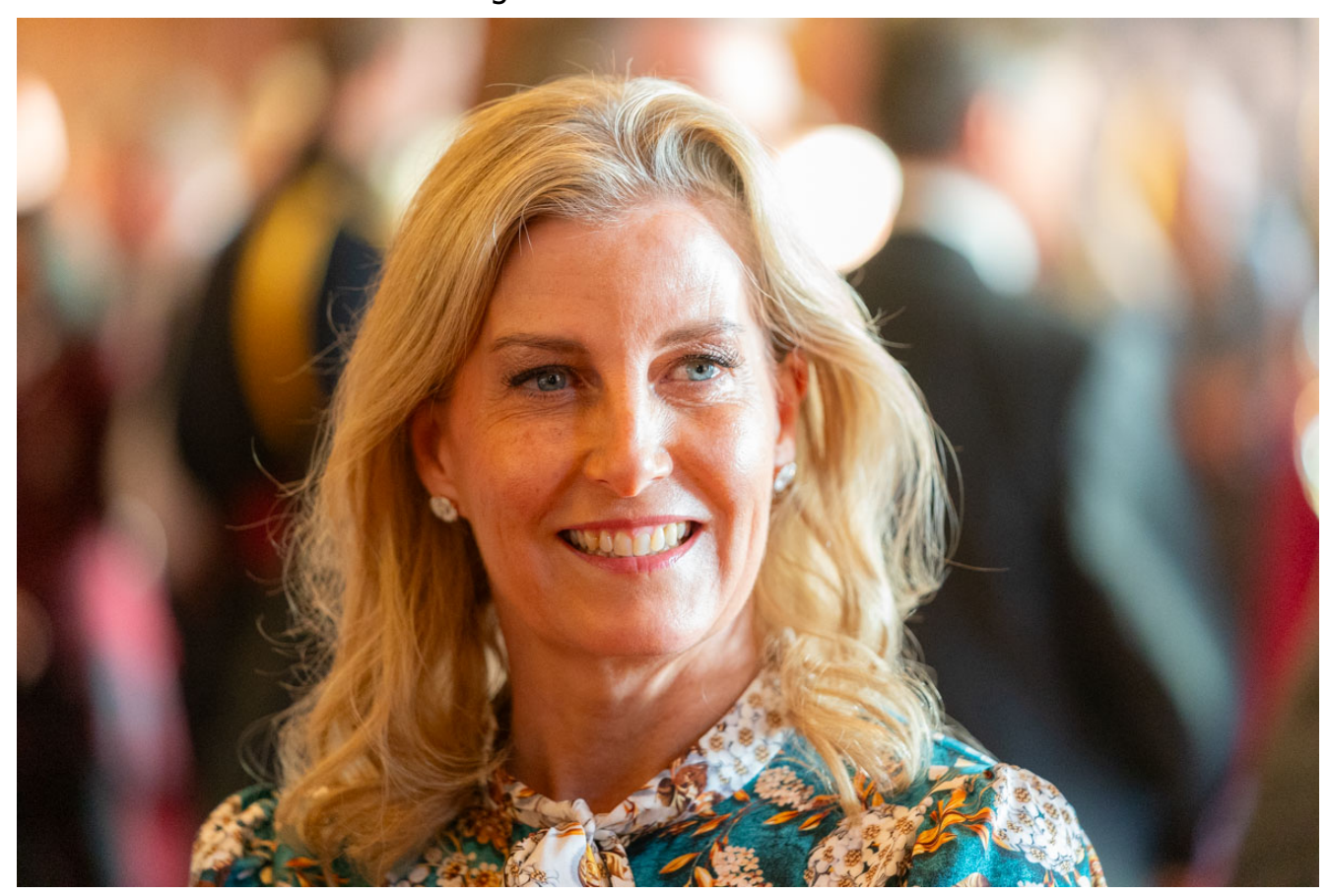
HRH The Duchess of Edinburgh