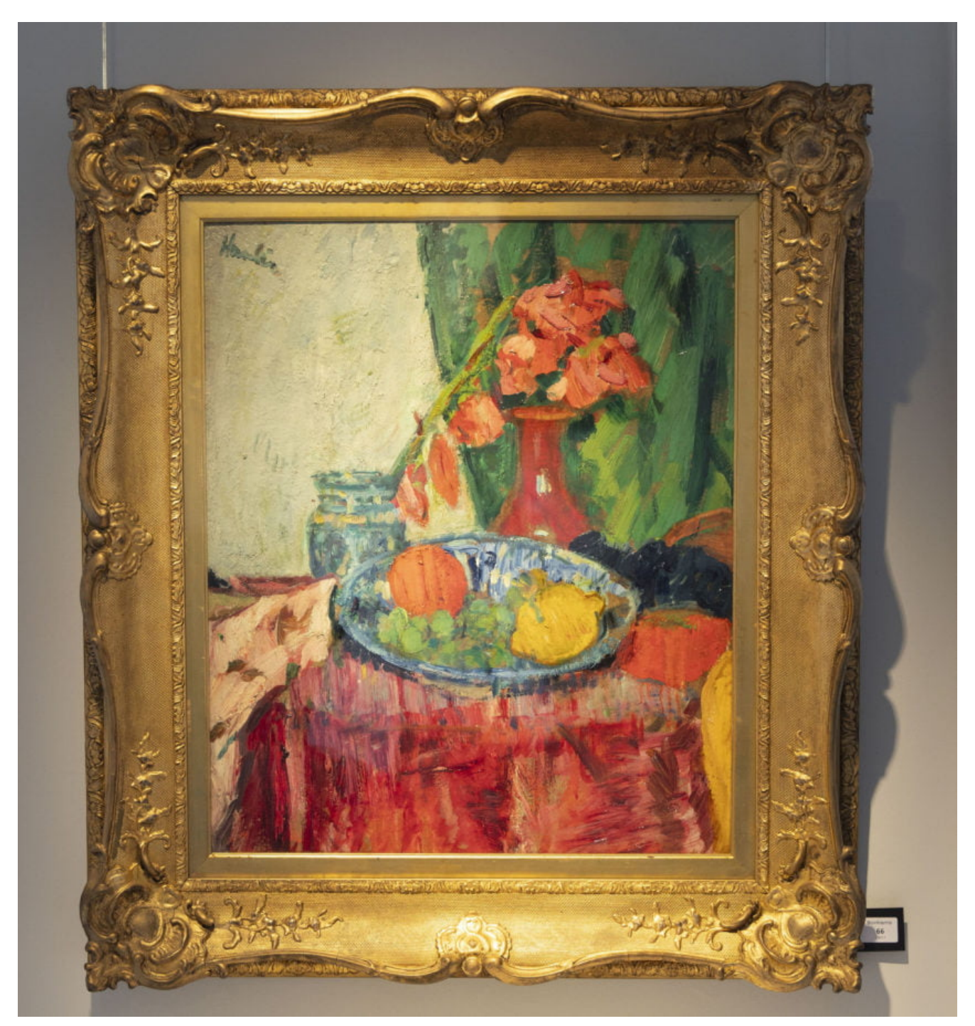
The Scottish Art sale at Bonhams Edinburgh