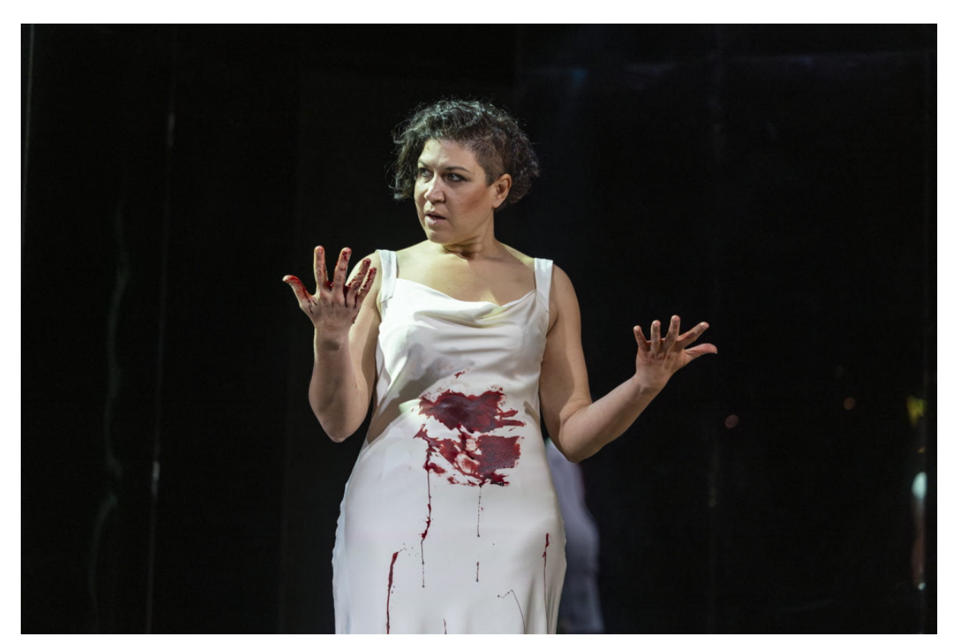
MACBETH (AN UNDOING) production photos taken on 7 March 2024 at the Rose Theatre, London

Direct from a run in New York, Macbeth: An Undoing (14-25 May) arrives back at the Lyceum this month. A retelling of the classic Scottish play, it puts Lady Macbeth at the heart of the story. When her husband returns victorious from battle with a prophecy he is to be King, Lady M is ruthless in her pursuit of power but quickly descends into madness and despair. Which begs the question, have we heard the whole story? It should be intriguing to see how it has evolved since its World Premiere at the Grindlay Street theatre in February 2023.