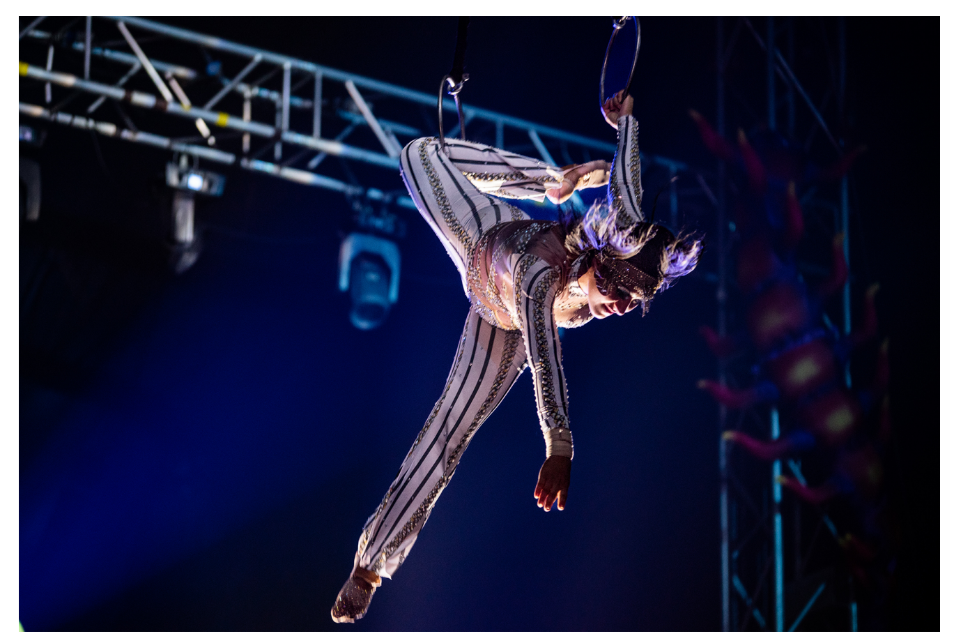
Big Kid Circus on 13th February 2024 — Gyle Shopping Centre, Edinburgh, Glasgow, Scotland