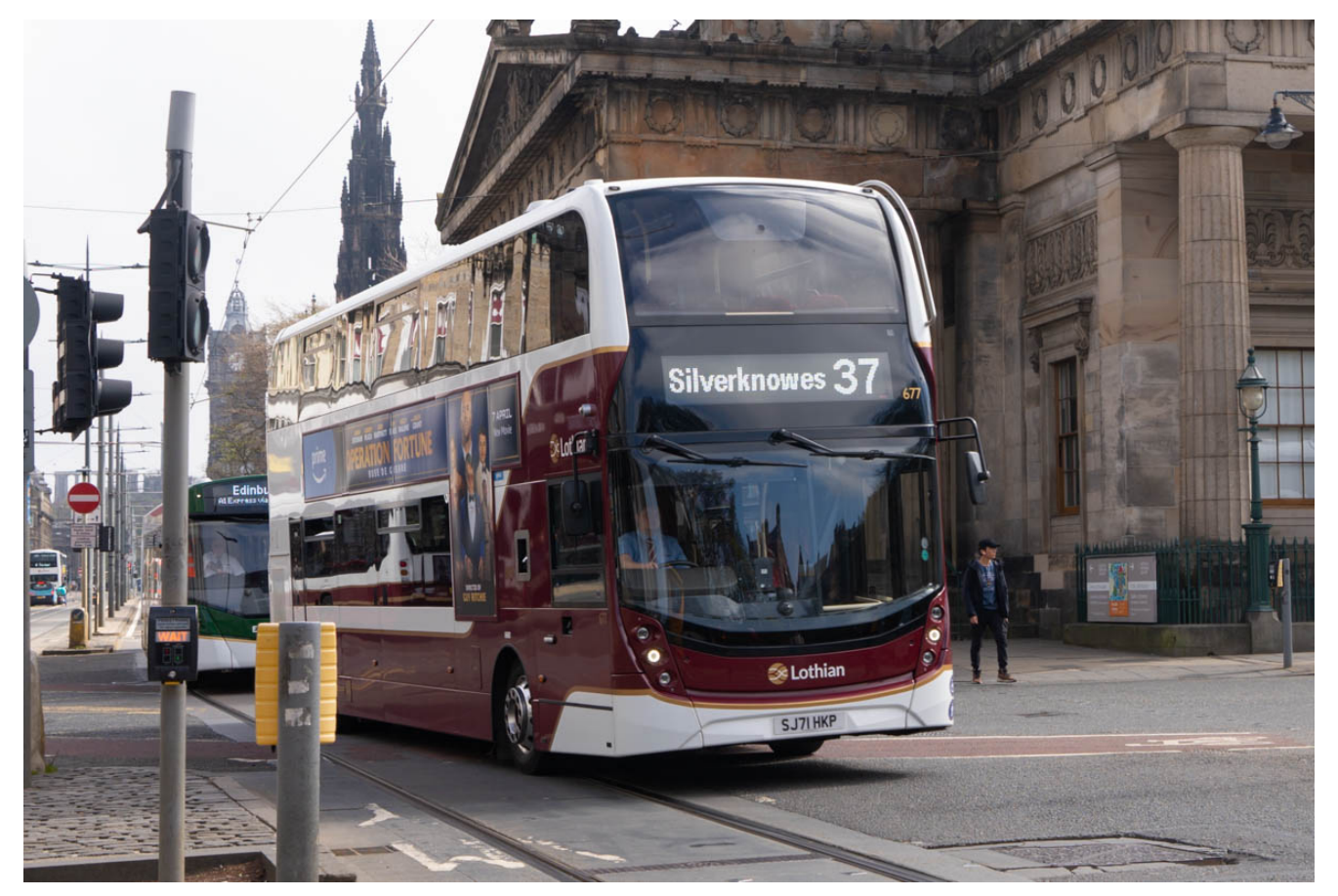
Lothian bus on Princes Street