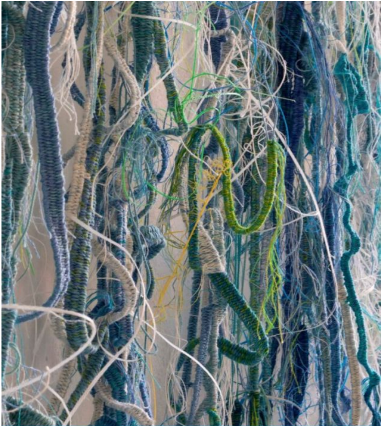
Wall of Water Fiona Hutchison