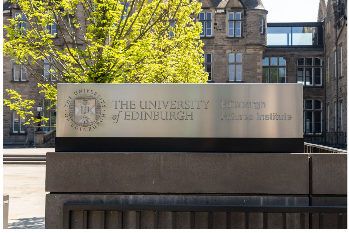
Edinburgh Futures Institute