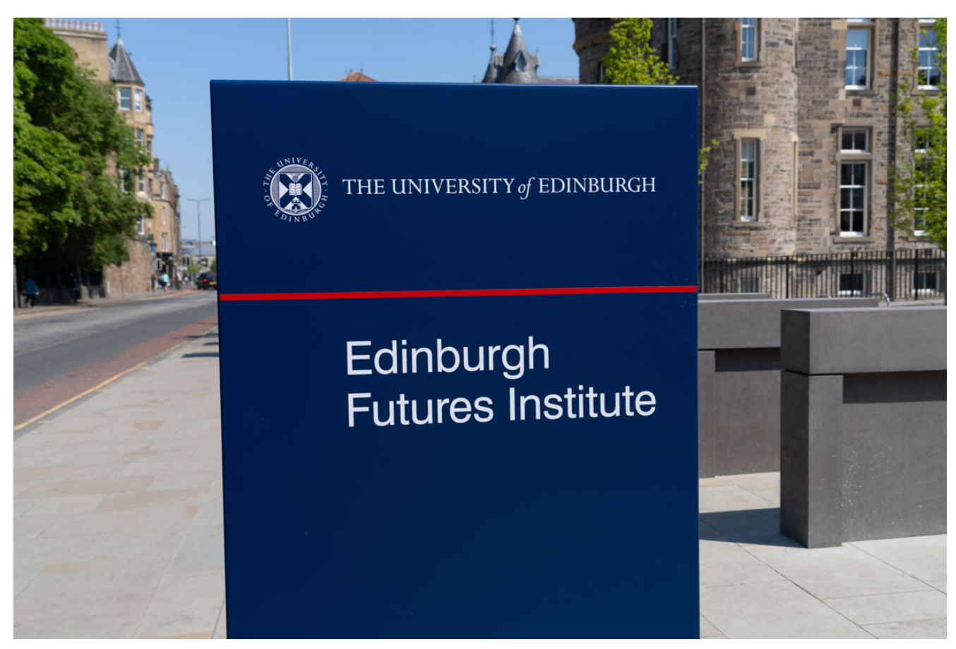
Edinburgh Futures Institute