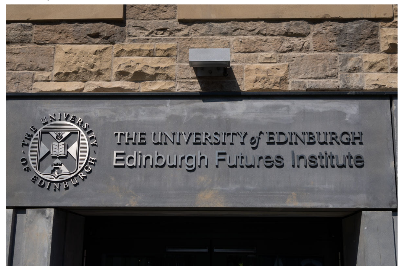
Edinburgh Futures Institute