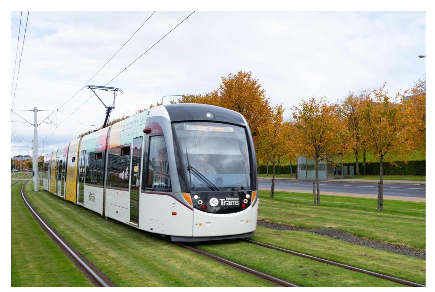
Edinburgh trams going greener.