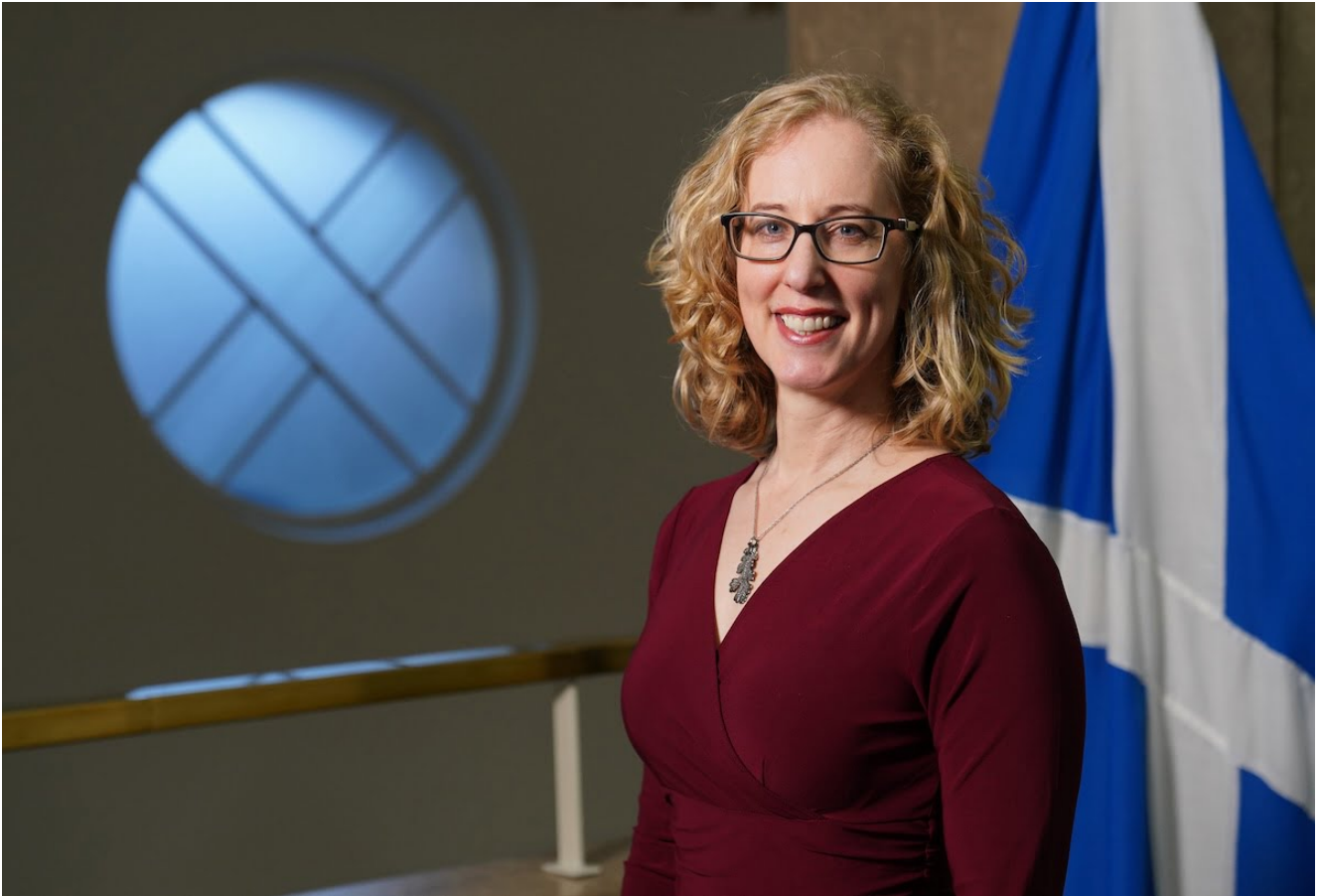
Lorna Slater MSP

Scottish Labour Deputy Leader Jackie Baillie said: “This chaotic and incompetent government is falling apart before our eyes while Scots pay the price.