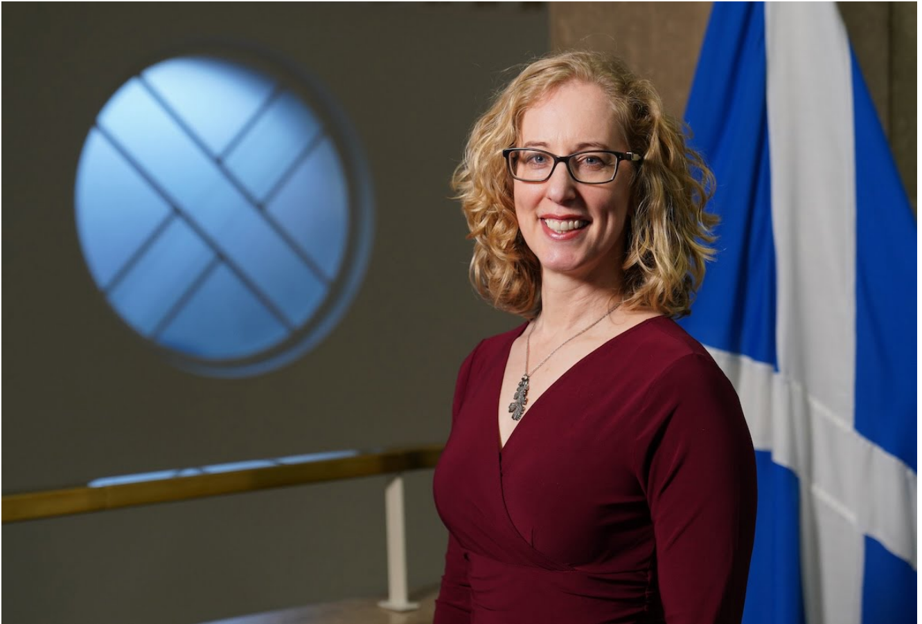
Lorna Slater MSP

Scottish Labour Deputy Leader Jackie Baillie said: “This chaotic and incompetent government is falling apart before our eyes while Scots pay the price.