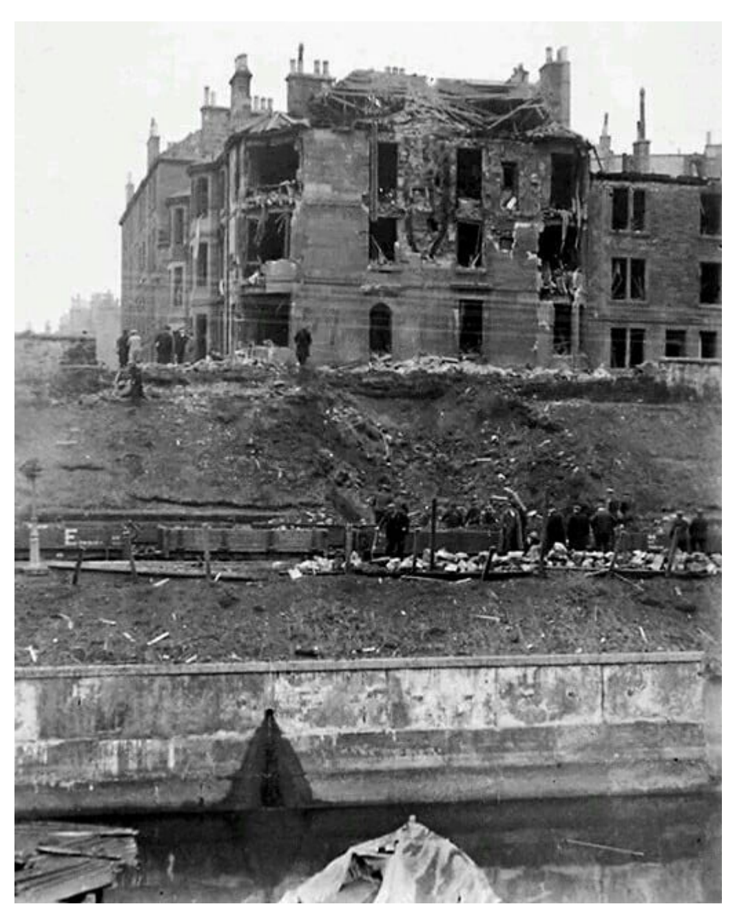
7 April 1941