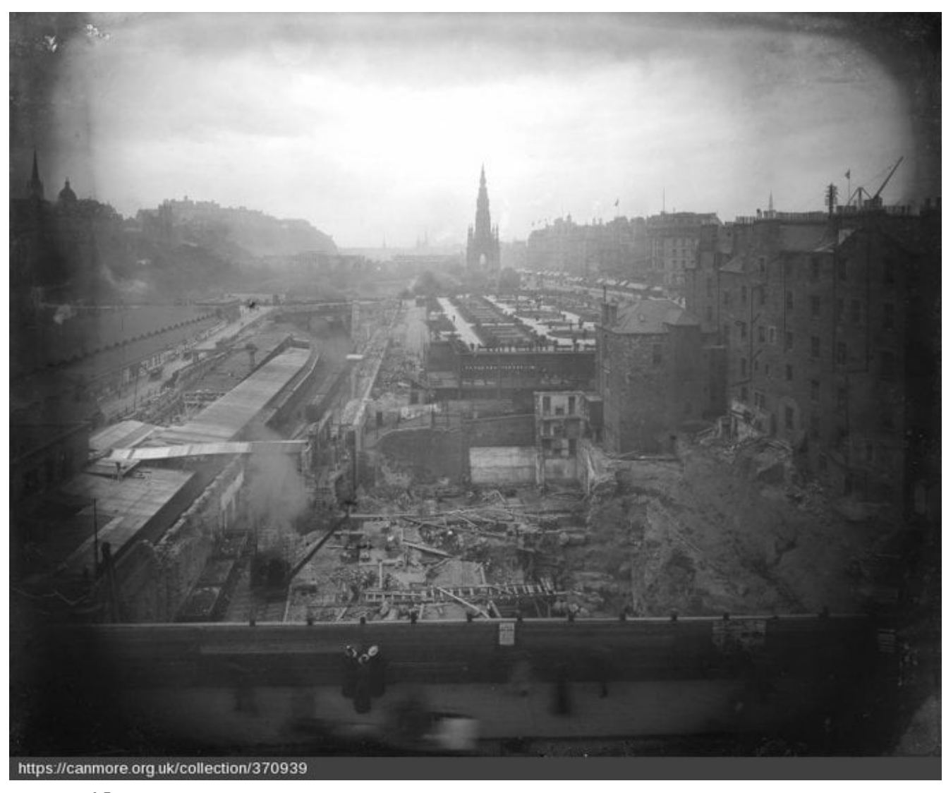
10 April 1890