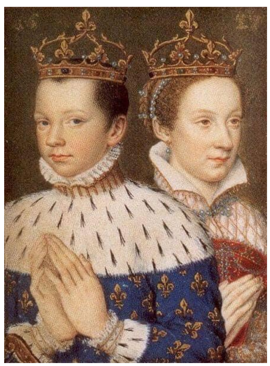
24 April 1558