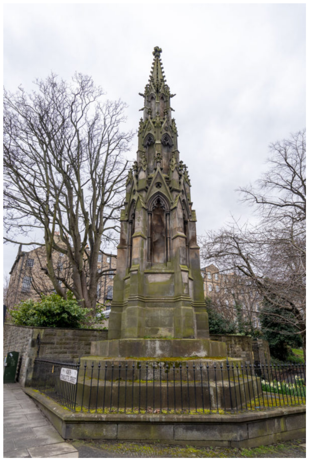
17 April Catherine Sinclair Monument.