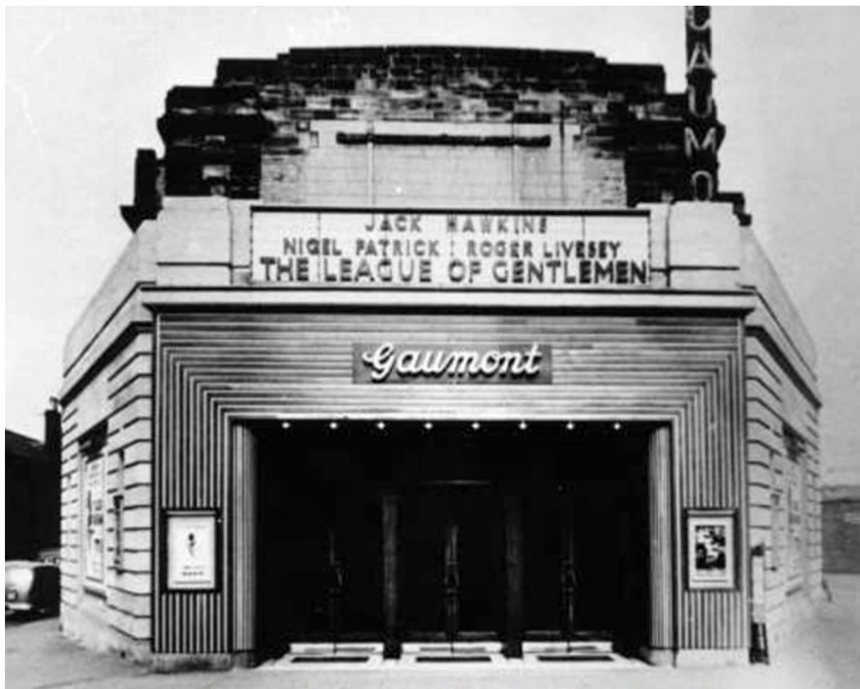
Rutland / Gaumont Cinema, 4-8 Canning Street, Edinburgh.