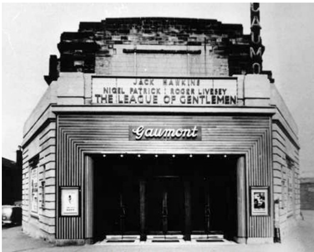
Rutland / Gaumont Cinema, 4-8 Canning Street, Edinburgh.