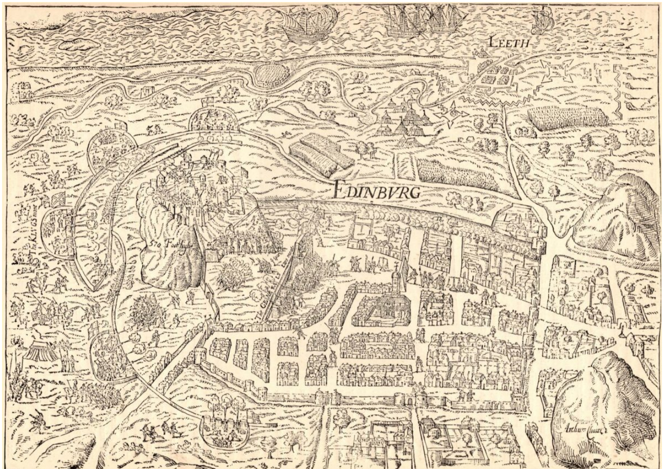
REDUCED FAC-SIMILE OF A PLAN OF THE SIEGE OF EDINBURGH CASTLE IN 1573. (From Holinshed.)