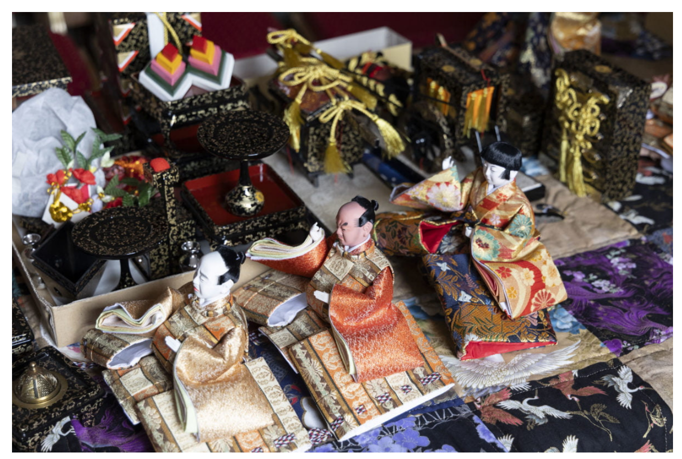
18/4/2024 Lauriston Castle Edinburgh Japan Sakura Festival — Hina Dolls