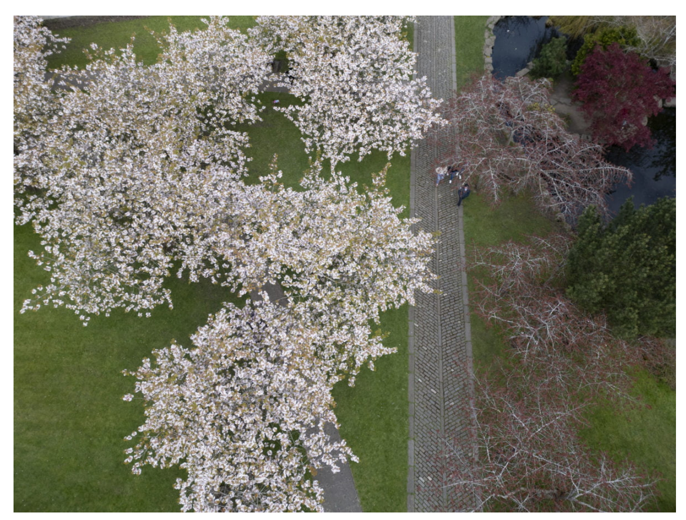
18/4/2024 Lauriston Castle Edinburgh Japan Sakura Festival.