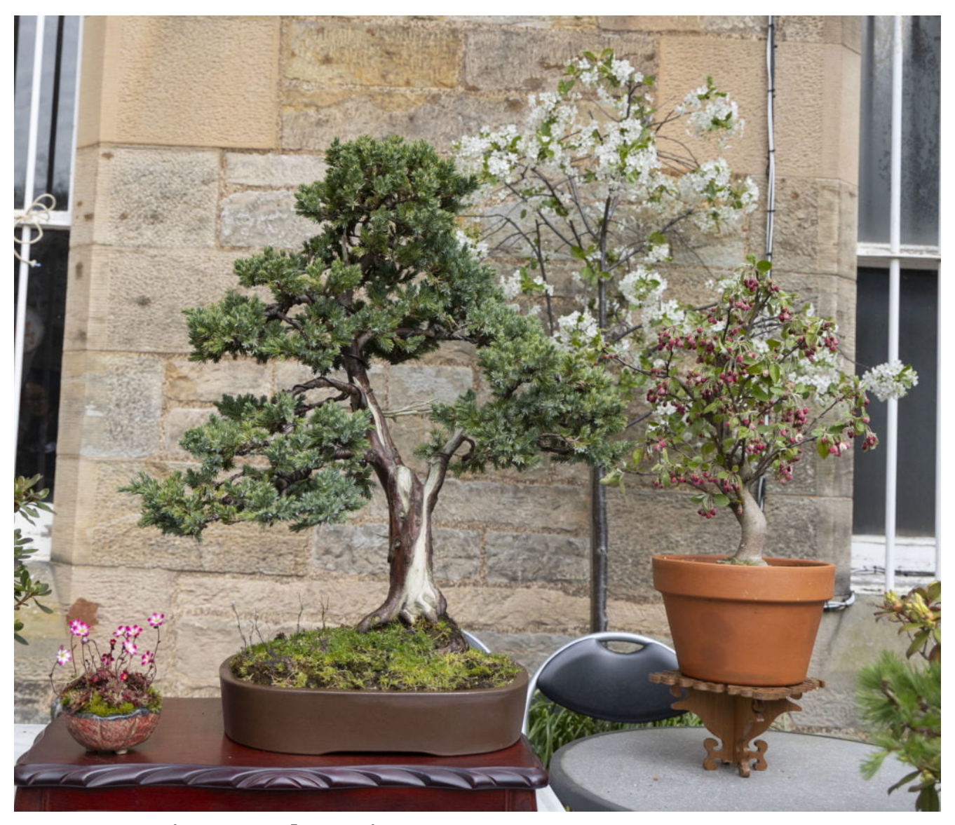
18/4/2024 Lauriston Castle Edinburgh Sakura (Blossom) Festival — the Bonsai trees.