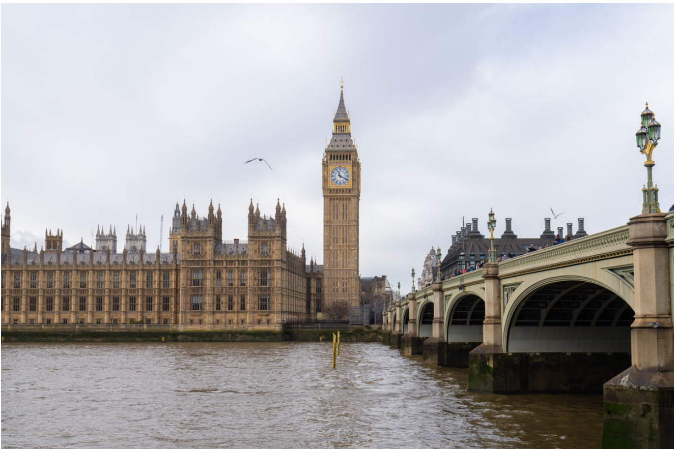
House of Commons Westminster