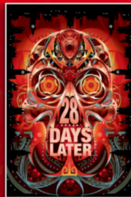
28 DAYS LATER